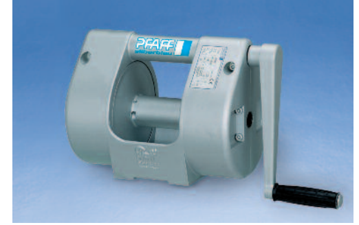
SW-K GAMMA - 500kg