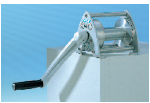
SW-K GAMMA - 200kg