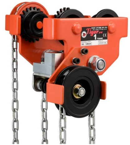
1t Geared Trolley with optional beam locking device