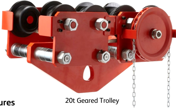
20t Geared Trolley