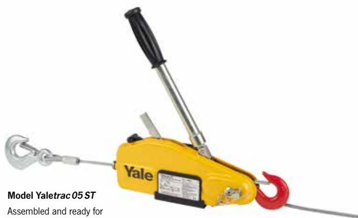
Model Yaletrac 05 ST Assembled and ready for operation (installed)