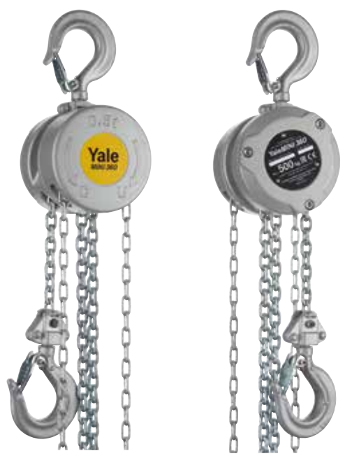
Capacity 500 kg