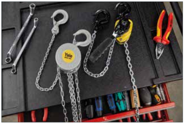
Fits in every tool box