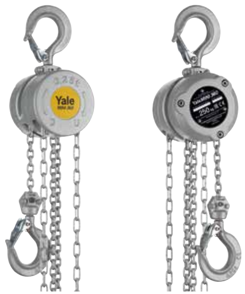
Capacity 250 kg