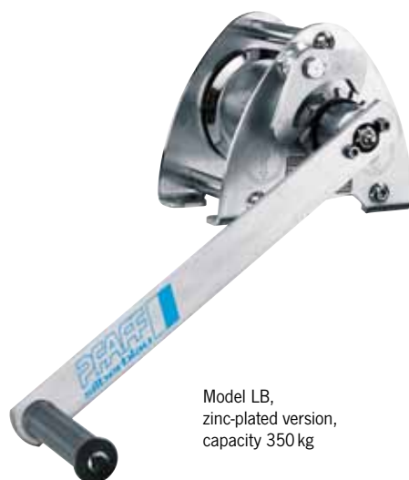
Model LB, zinc-plated version, capacity 350 kg