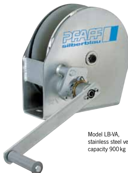
Model LB-VA, stainless steel version, capacity 900 kg