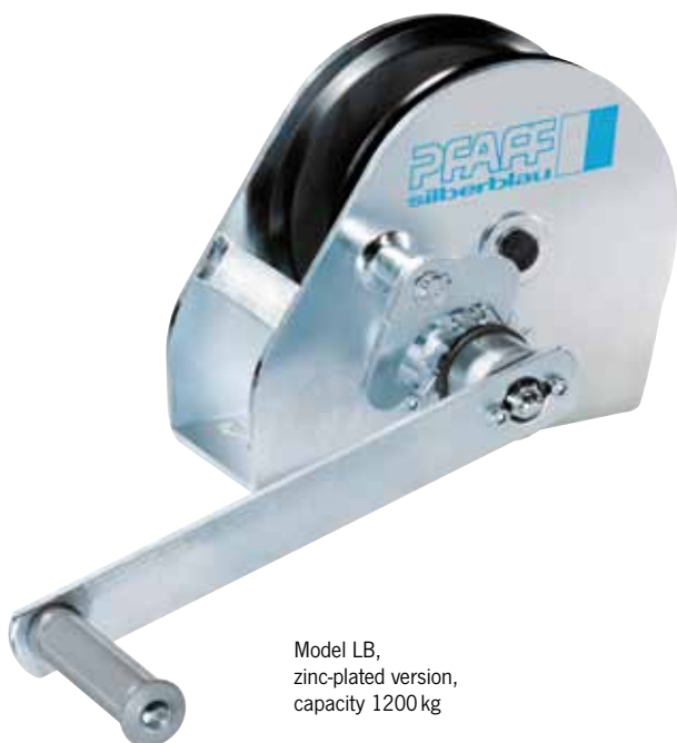
Model LB, zinc-plated version, capacity 1200 kg