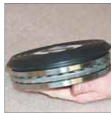
Ball bearing for turning plate