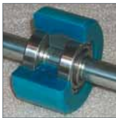
Rollers with ball bearing