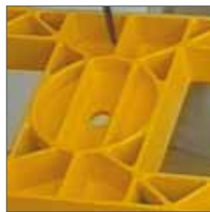
Chassis from ductile graphite iron