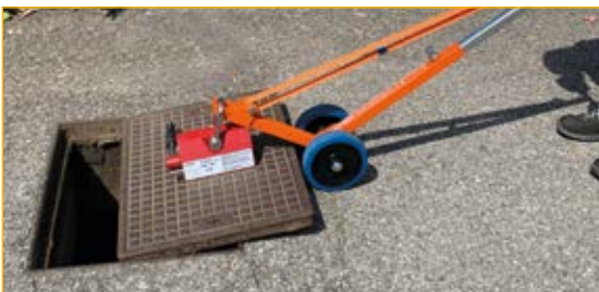
Use 2: combination APS80 and Permanent magnet PM400 or PM500.