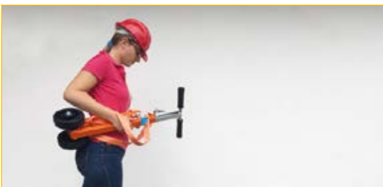
Foldable, extremely compact and light weight, easily transportable.