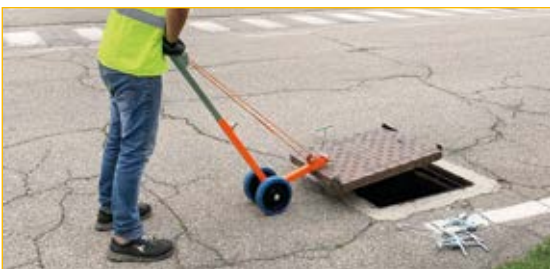
Use 3: combination APS80 with mechanical clamp and hooks set