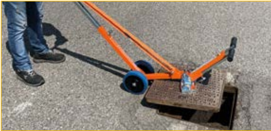
Use 1: opening with magnetic CL9 - CL10 - CL11.

Extendable and tilting upper handle. Lightened and simplified version of the APS90. Ideal for opening manhole covers that have lifting problems, in difficult operations and opening of heavy manhole covers with minimum effort and maximum safety