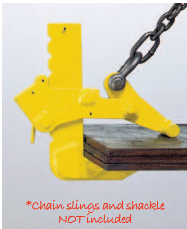
*Chain slings and shackle NOT included

The ACH horizontal plate clamps offer superb flexibility because of the large adjustable jaw opening. The jaw is adjusted using a simple ratchet mechanism.