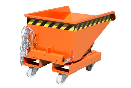
EXPO-E with castors