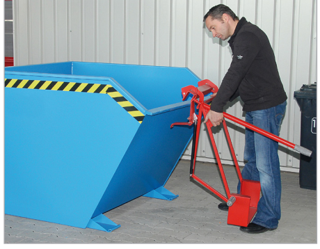
Emptying Set in use on site