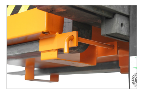
Secured by bolt to prevent slipping