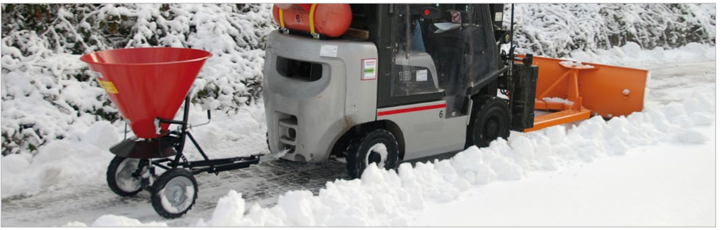
Snowdozer SCH-G with an STW 100