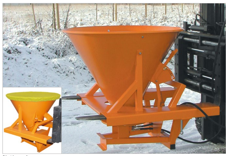
SH with tarpaulin