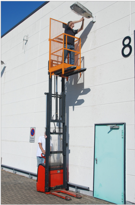
MB-I with straddle stacker