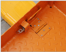
Safety mechanism for a straddle stacker