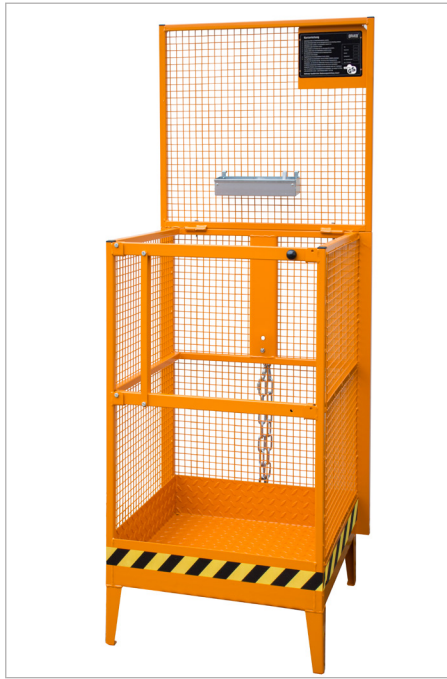
MB-I secured to the forklift by chain