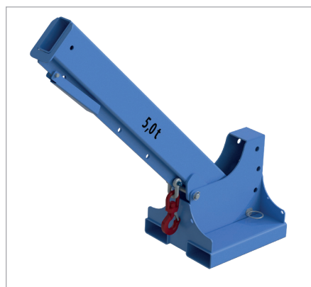
KTH-K at an elevated working height