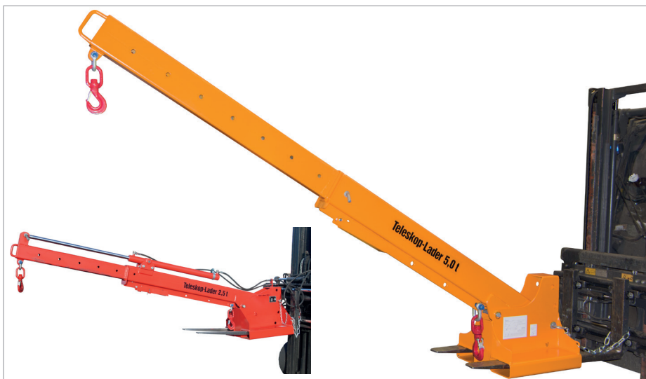
Hydraulic extension function (KTH)