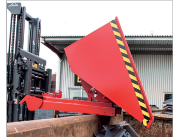
Emptied by activating release point 2