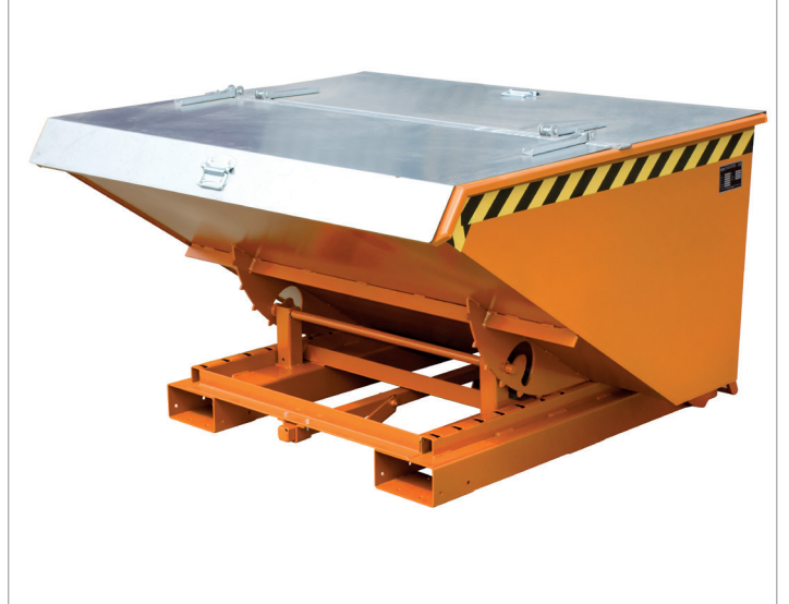
The 4A with a lid