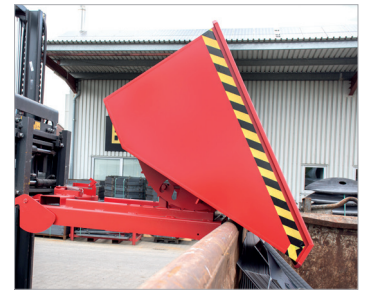
Emptied by activating release point 1