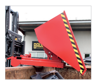
Emptied by activating release point 3