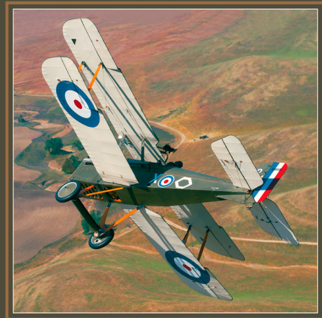
Royal Aircraft Factory S.E.3a - Paso Robles