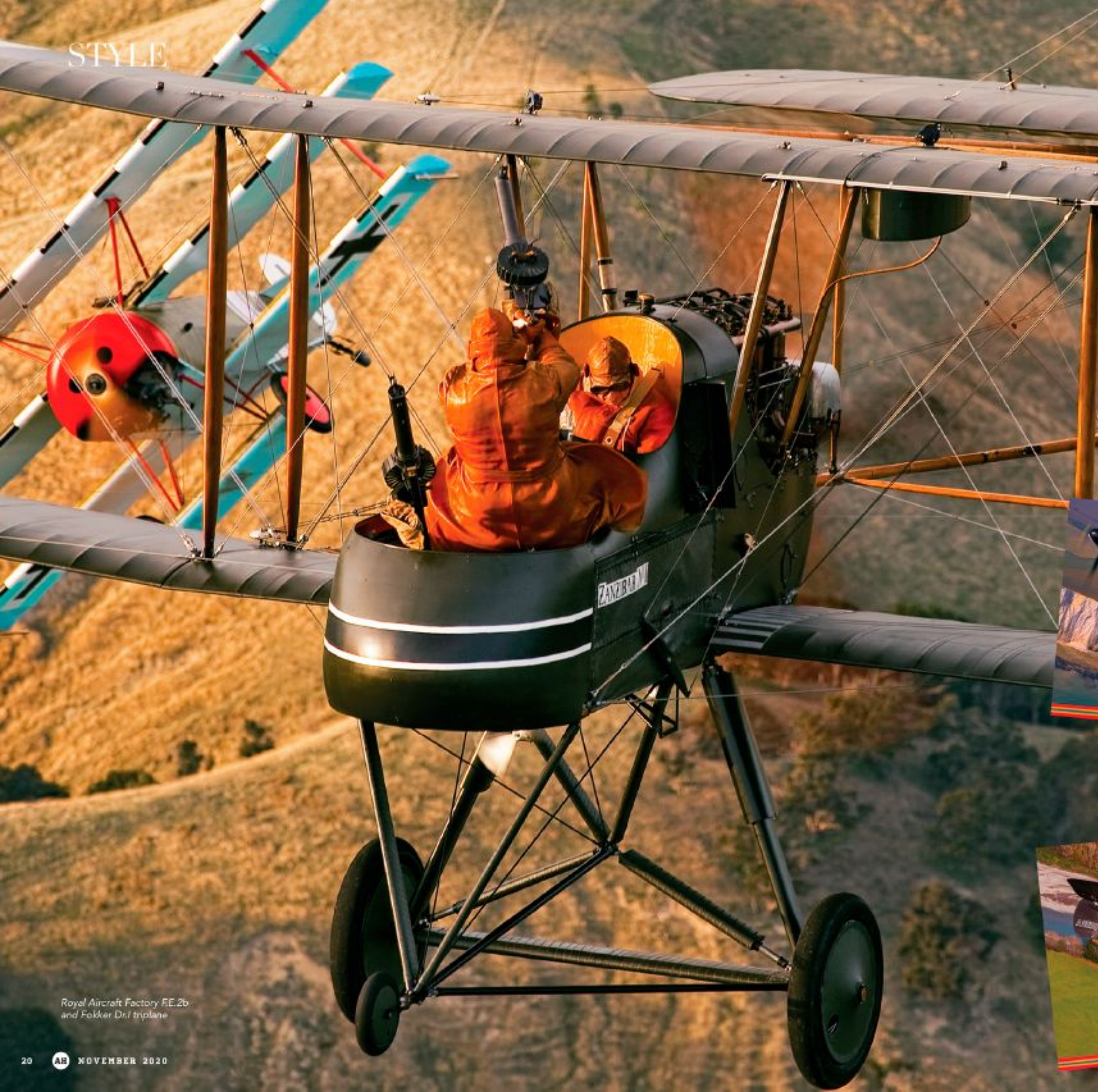
Royal Aircraft Factory FE.2b and Fokker Dr.I triplane