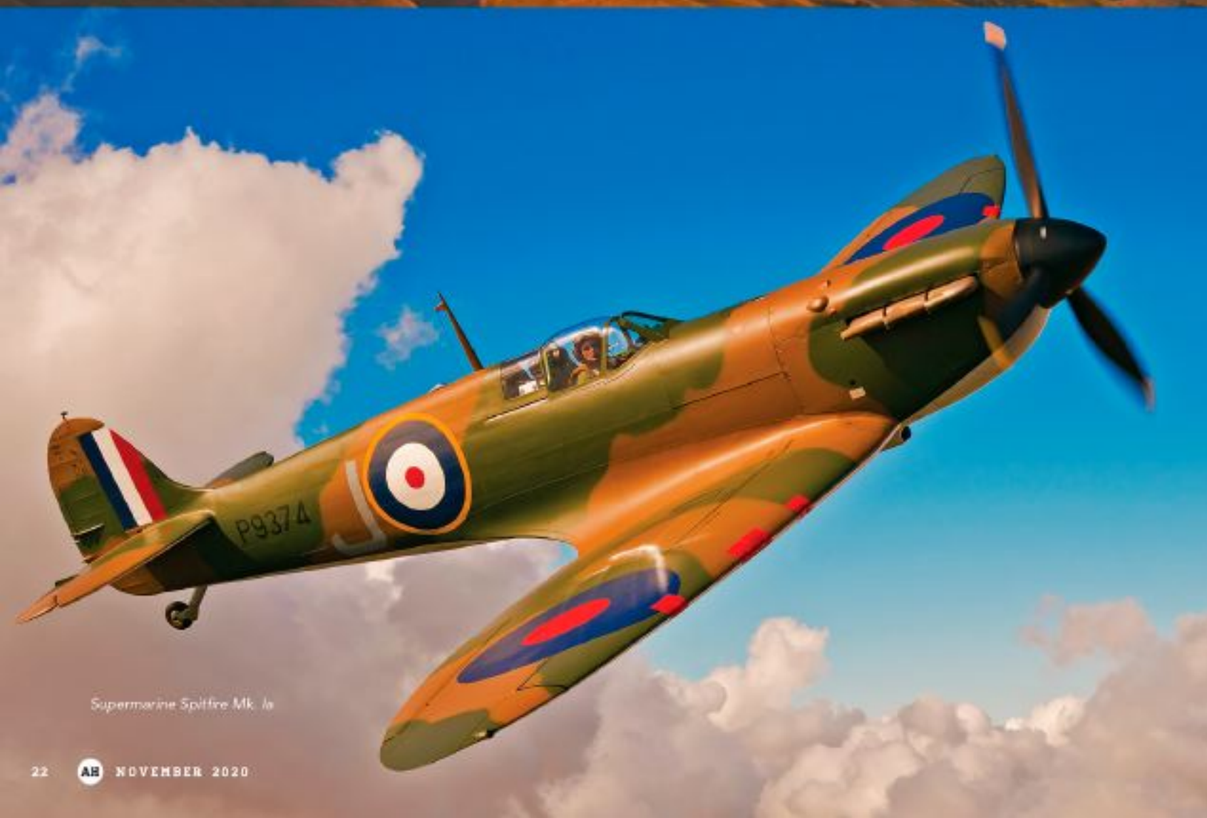
Supermarine Spitfire Mk. Ia