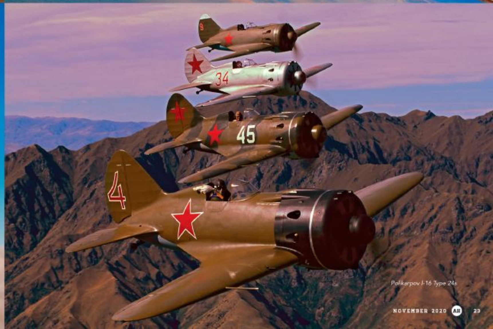
Polikarpov I-16 Type 24s