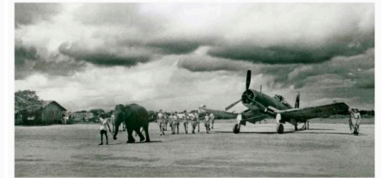
FACING PAGE: A jungle elephant loading a Corsair of the Fleet Air Arm at an airfield near the Indian Ocean, 1944

The historical photos paired with the photos Makanna took are a great contrast from the past and more recent years. As I was reading and looking at the photos I realized some of the planes in them are no longer exist. Some aircraft were destroyed and others may have been restored after their crash.