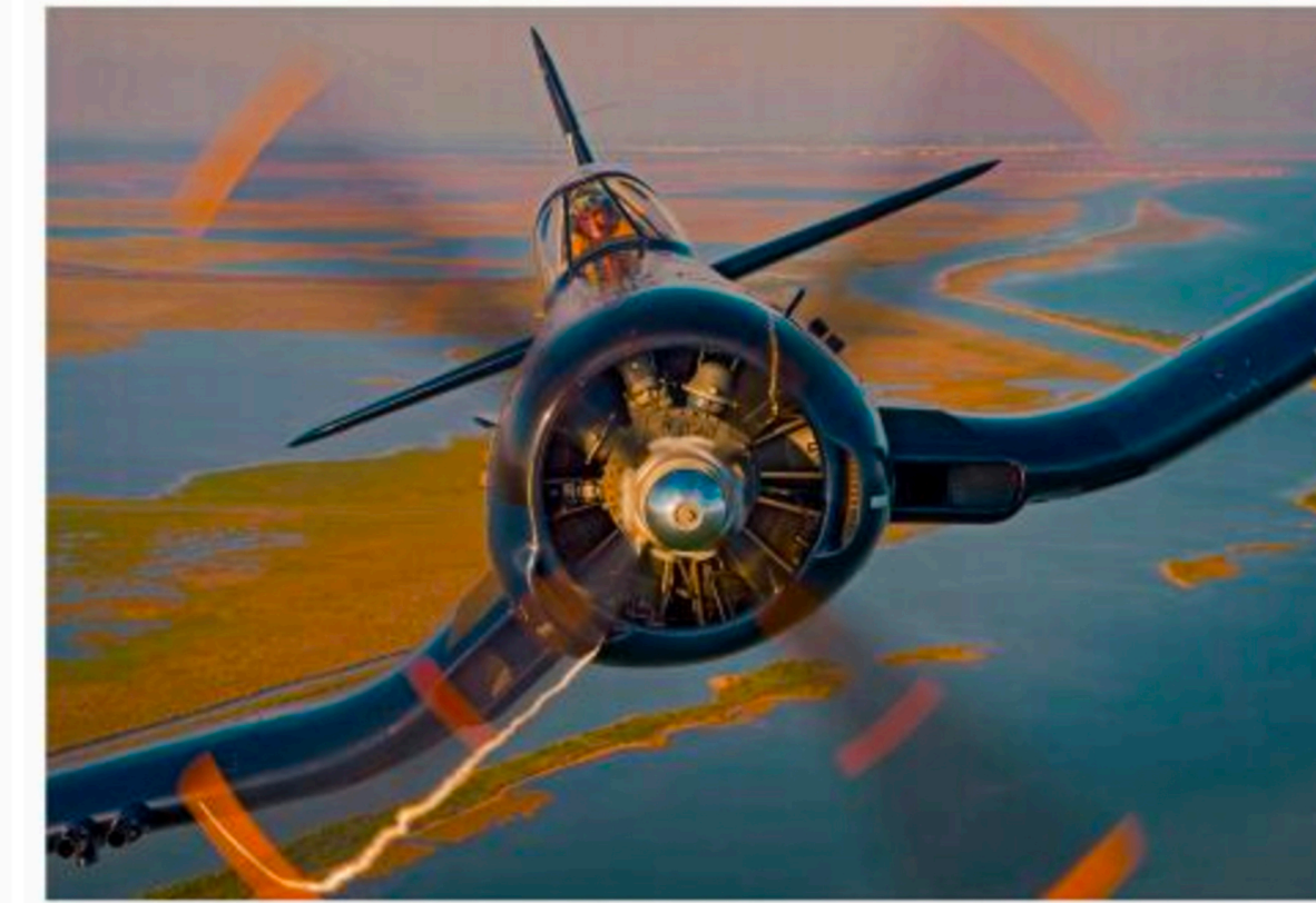
VOUGHT F4U-5N "CORSAIR" N43RW - Baranoff