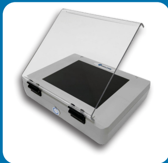
UV cover raised for excision of bands

The myView™ Transilluminator has a surprisingly small footprint (smaller than a standard piece of paper). However, the viewing surface is large enough to accommodate a mid-sized gel or multiple smaller gels. The 16.5 x 13.5 cm filter glass is scratch resistant to allow band excision with a metal blade.