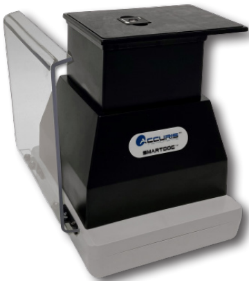
Compatible with SmartDoc™ Imaging Enclosure