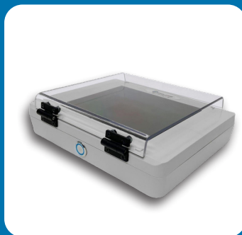
UV cover closed for gel viewing