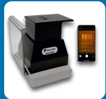
Use with SmartDoc™ for gel imaging with a smart phone