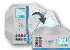
myVolt™ Touch Power Supplies