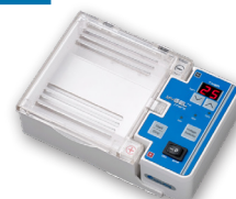
myGel™ Mini System

Web: www.transilluminators.com Phone: 800-779-1016 Email: sales@transilluminators.com