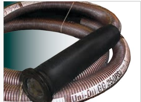
Hose is coiled and when placed on a pallet, is ready for shipment.