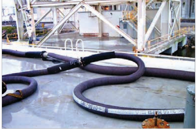
Hose in service: Note the gradual bend achieved off of the horizontal connections