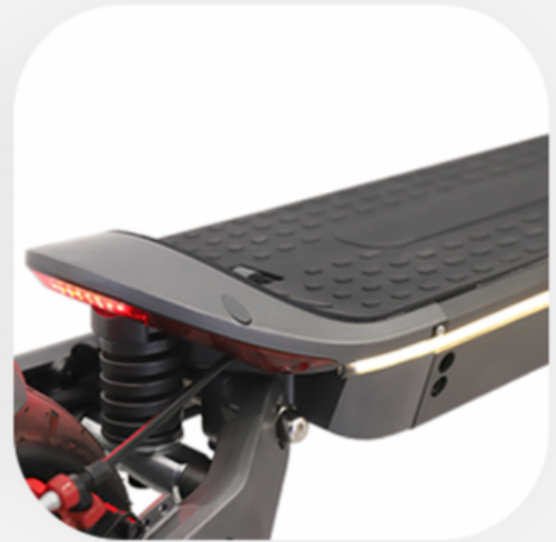
Streamlined light strip