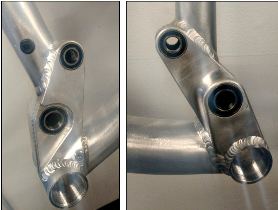
Black Seals Face Outwards