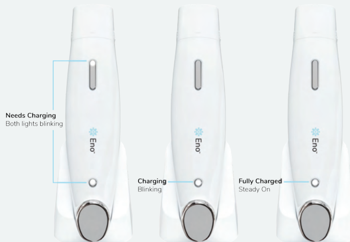
Battery Light Indicators

The Eno™ utilizes a touchless induction charging system, which may cause the device to feel warm when you remove it from the charger. Do not use the device if it feels too hot, unplug the charging cradle and contact customer service at customerservice@olura.us .