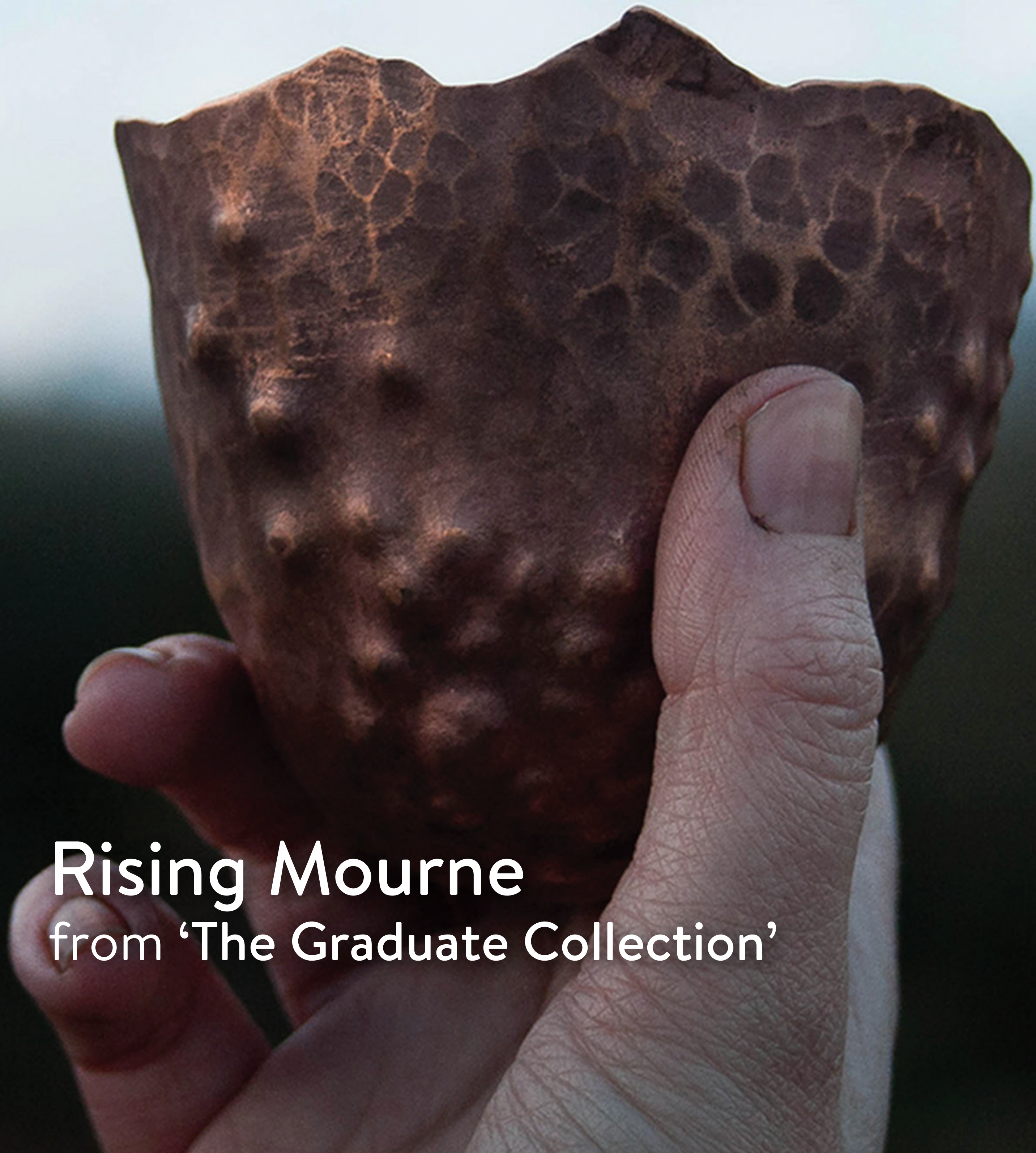
Rising Mourne from 'The Graduate Collection'