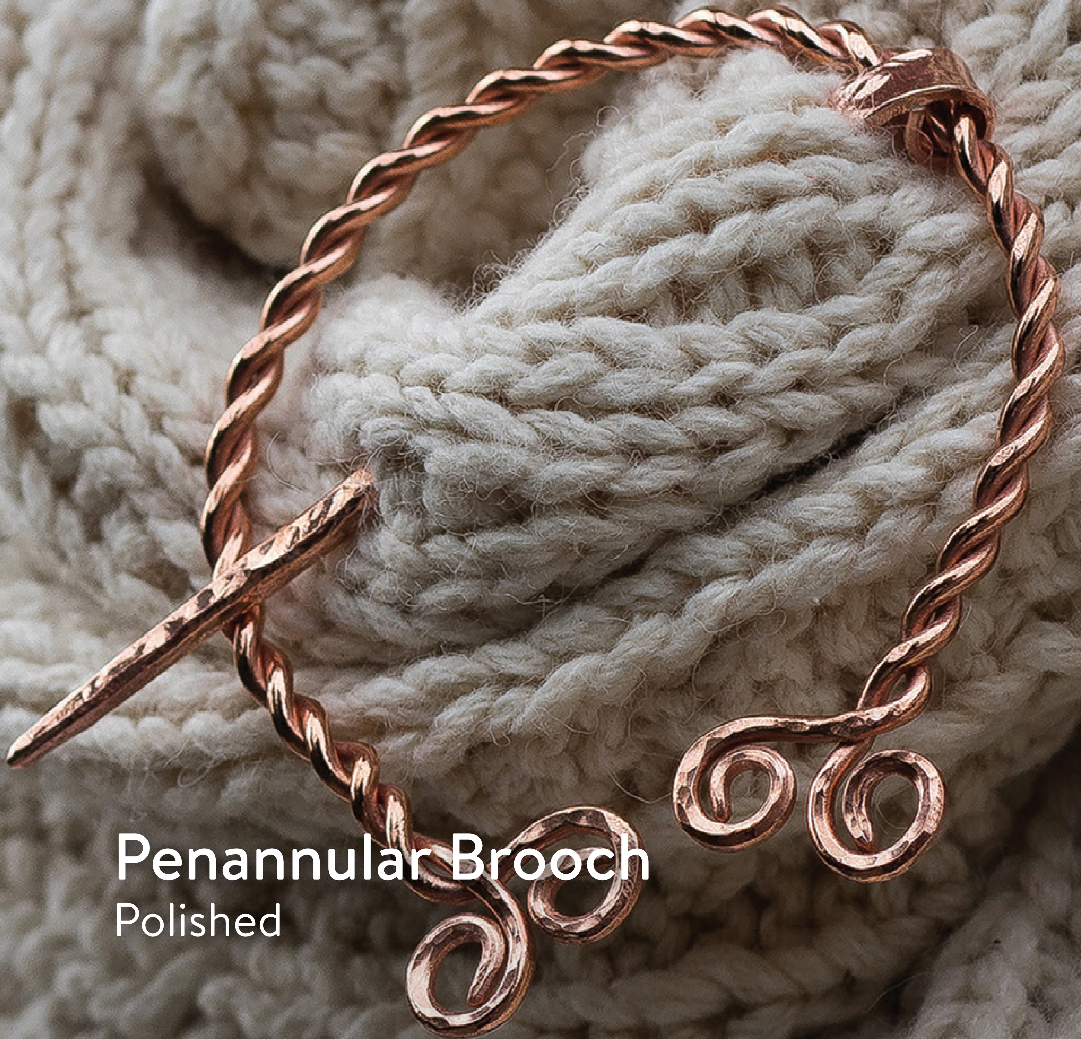
Penannular Brooch Polished