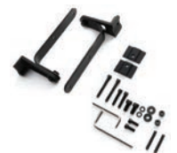
ACC-SEBKT1 SE-MBV1 Mounting Bracket Kit SE V1