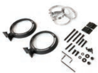
ACC-SEBKT3 SE-MBV3 Mounting Bracket Kit SE V3