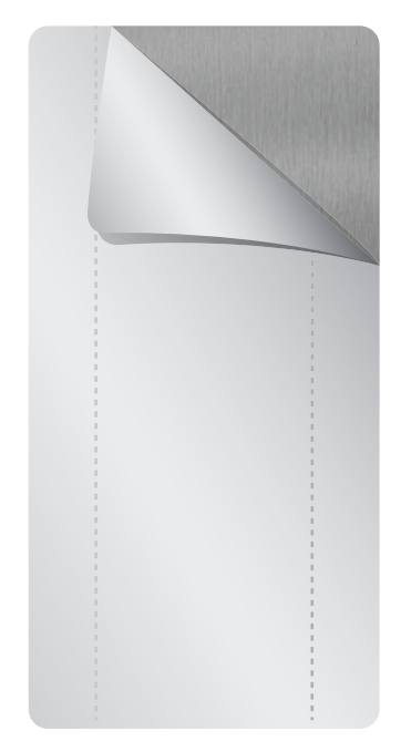
Front Laserguard Film