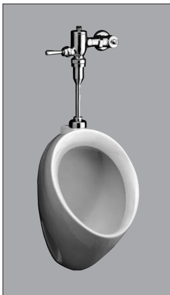
UT104 Top Spud