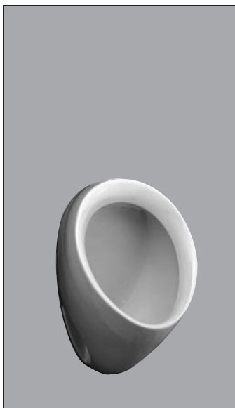
UT104V Back Spud