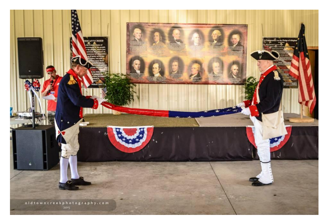
Folding the flag