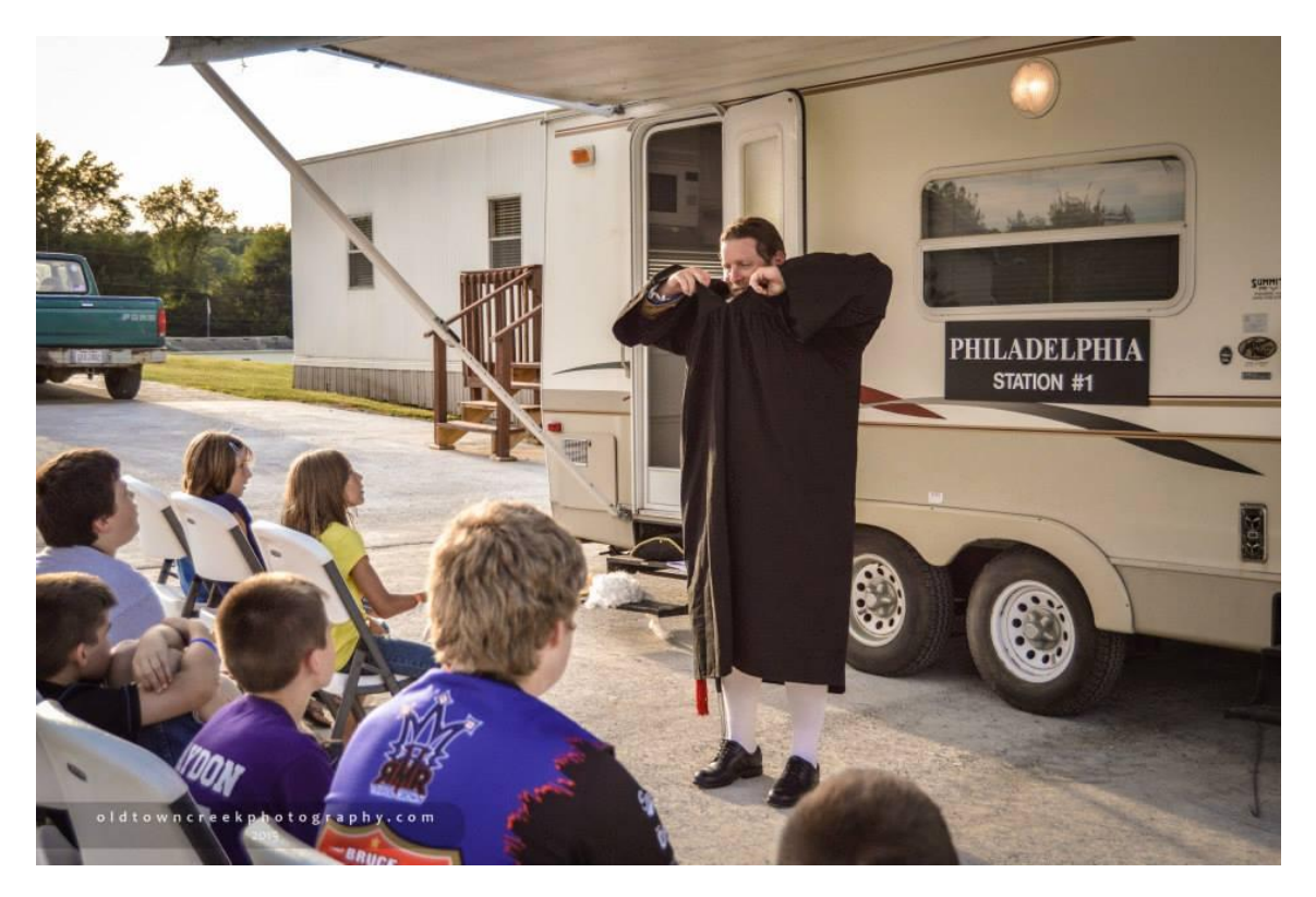
The robe is removed......