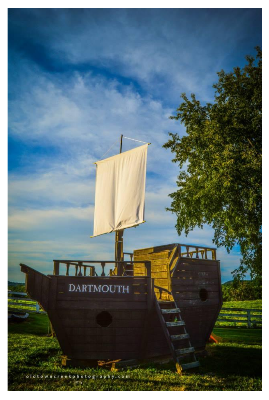
The Dartmouth loaded with East India Company tea