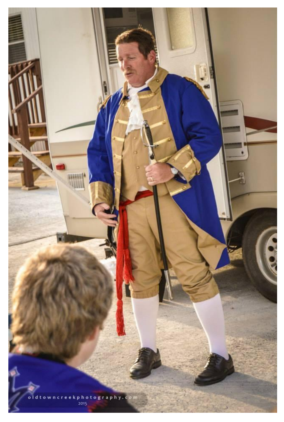
General Muhlenberg ready to lead his congregation into battle.