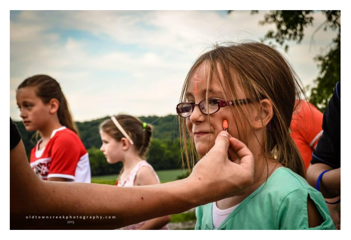
The Sons of Liberty prepare