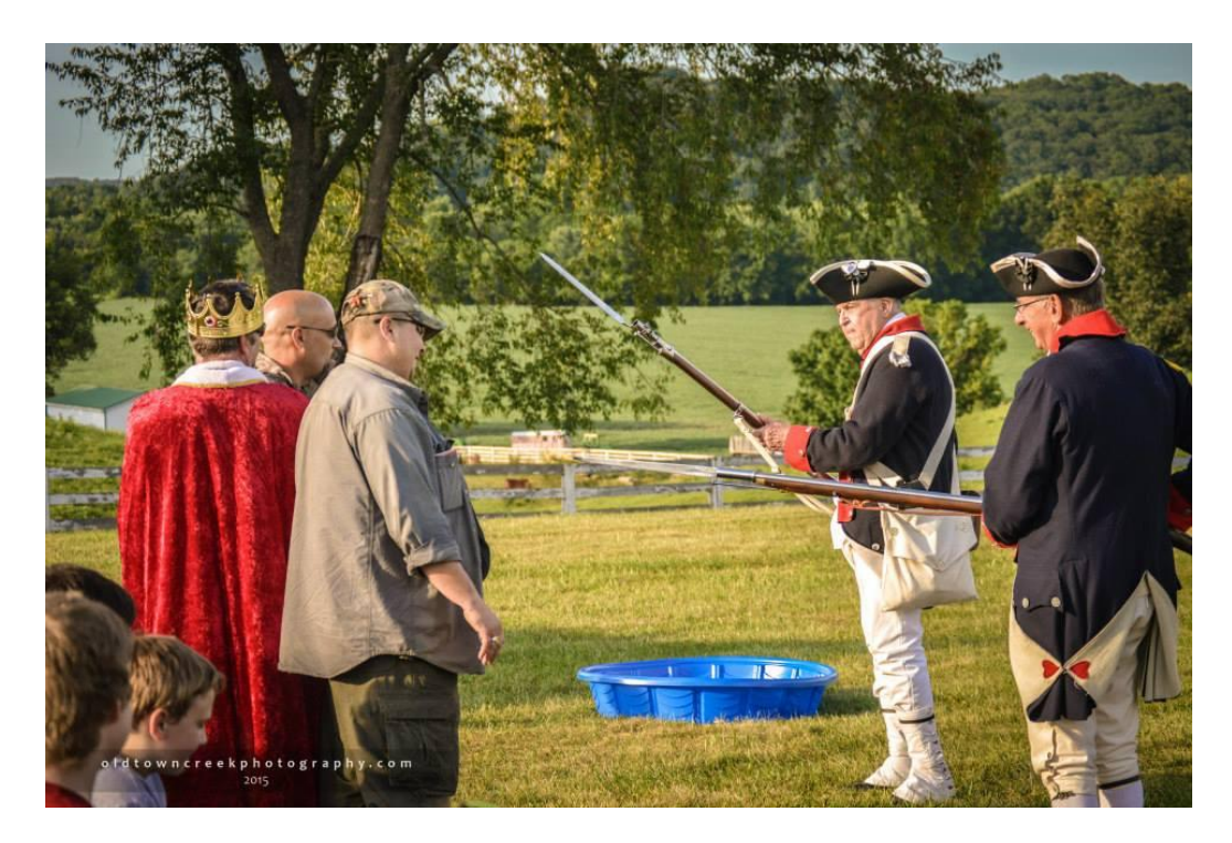
It's time for King George to retreat!