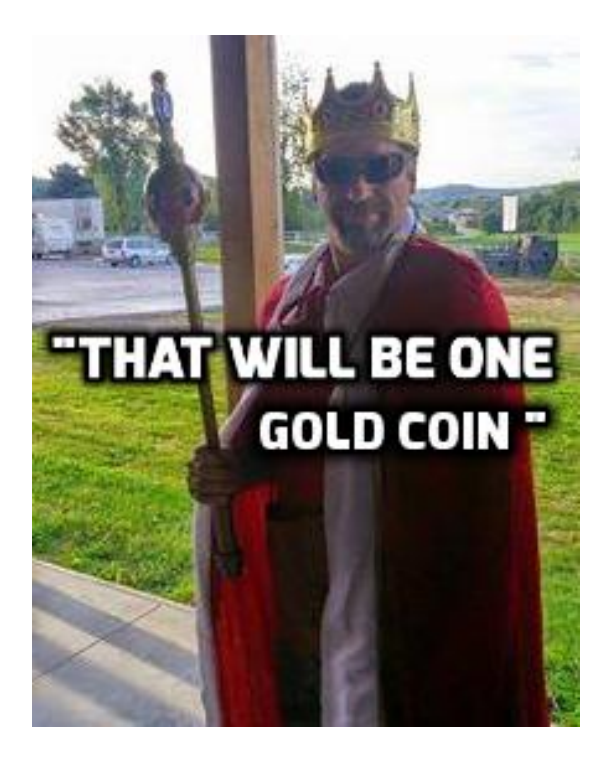
King George (did he really wear sunglasses?)