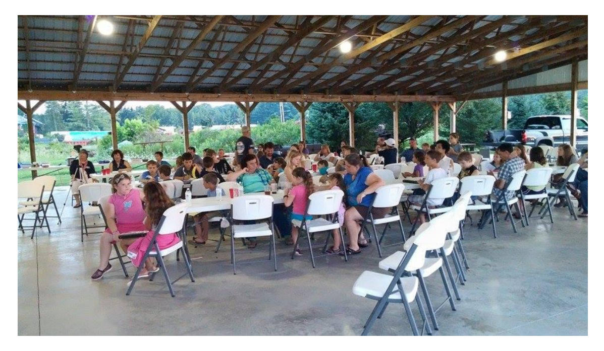
Campers and their families enjoy fellowship at the picnic

Friday was "Family Night," highlighted by a potluck/picnic, learning about the Declaration of Independence, the Liberty Store, and Patriot Dodge Ball. Campers used quill pens to sign their own Declaration of Independence. We did an experiment with baking soda and vinegar to learn the meaning of "the Law of Nature and Nature's God."