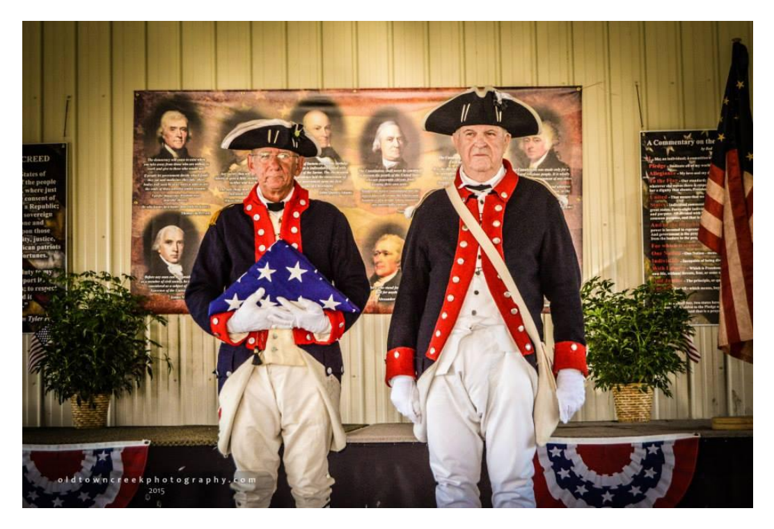
Presentation of the folded flag