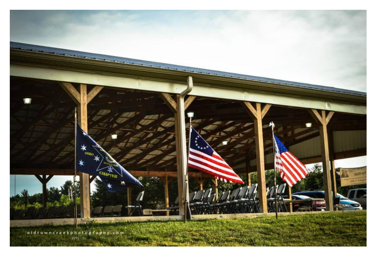
The Colors are posted outside the shelter house

Each day of camp consisted of three learning stations, an activity, and snacks. There was a theme for each day.