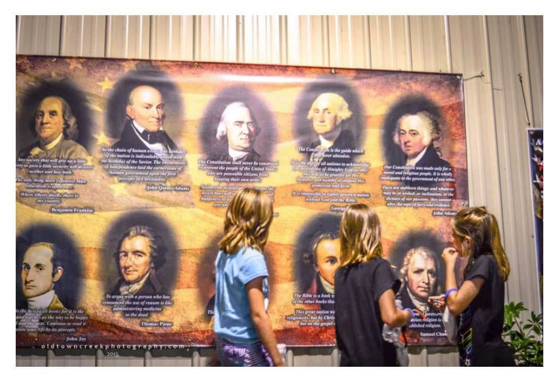
Children reading the quotes on the Founders' Wall