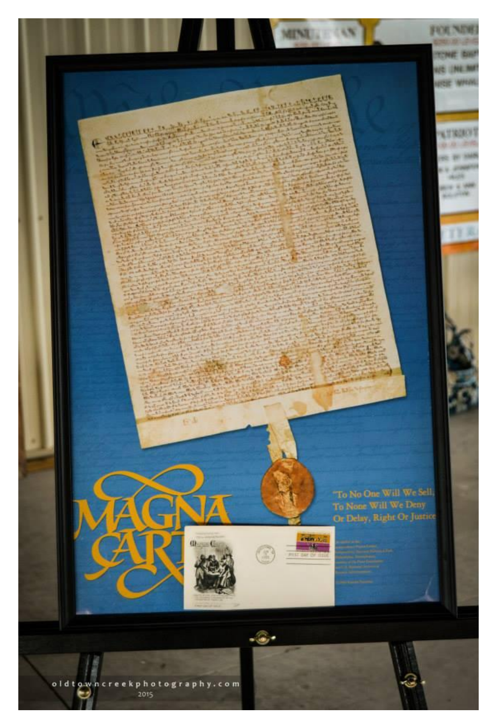
This poster shows a copy of the original Magna Carta. The copy was presented to Independence Hall in Philadelphia by Ross Perot.