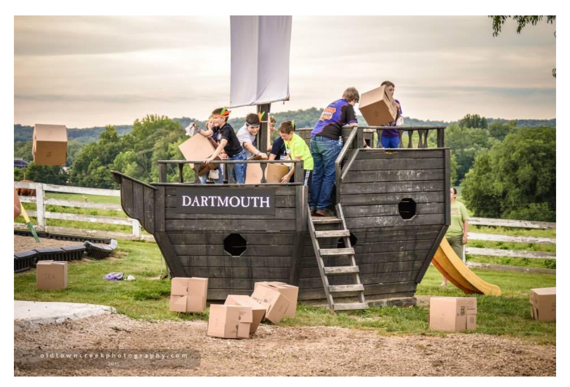
And the tea goes overboard