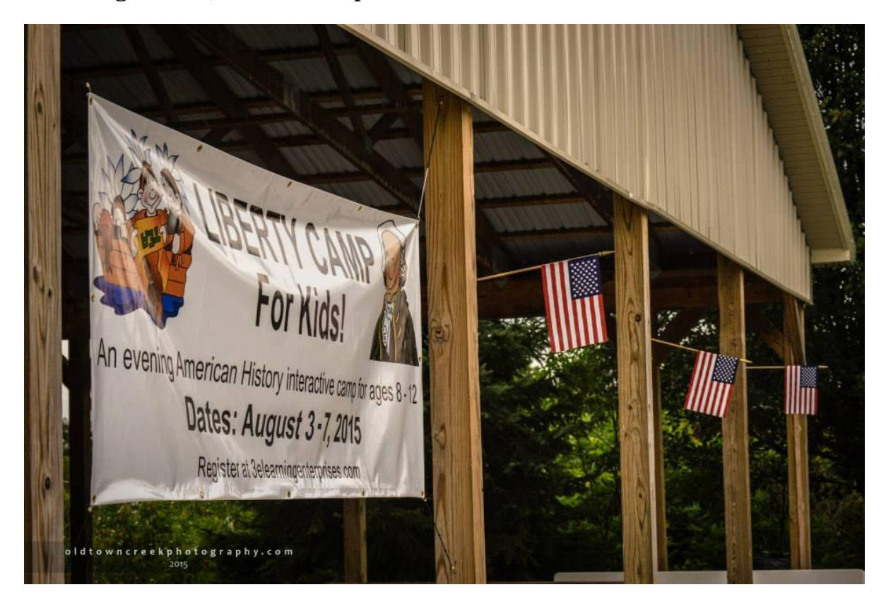
Welcome to Liberty Camp!

The first ever Hocking Hills Liberty Camp was held August 3 – 7, 2015 on the grounds of Cornerstone Baptist Church in Logan, Ohio. The camp was for children ages 8-12, and 36 campers attended.