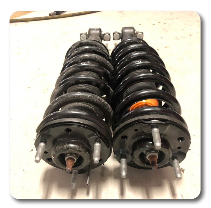
Figure 11B (Strut on the right has the top hat rotated 180 degrees, strut on the left is stock orientation with the bar pin angle the same)

16. Install the shorter 10mm bolts through the hex holes on the bottom of the front strut spacer (05047). The front strut spacer will have a slight taper to it. Attach strut spacer on top of the factory strut with high side of the taper towards the outside of the vehicle. Tighten to the top plate using the provided 10mm washer and OE strut nuts to 35 ft-lbs as shown in Figure 12C. DO NOT EXCEED 35 ft-lbs when tightening the spacer to the strut.