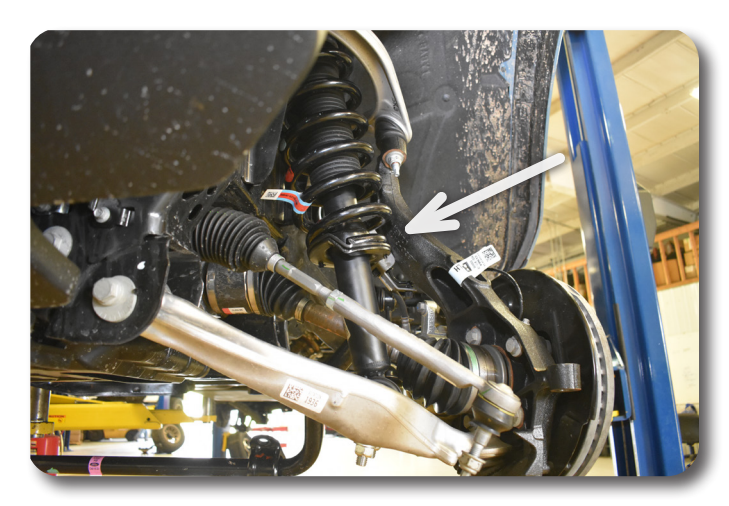
Figure 13C (Driver Side viewed from the front)