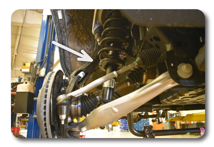
Figure 13D (Passenger Side viewed from the front)