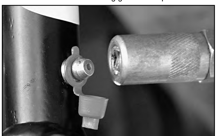
©2014 JKS Manufacturing, Inc & Aftermarketing, LLC Revision Date 2/26/2016

Lubricate all Grease Zerk fittings on the Adjustable Sway Bar Links immediately after installation using common wheel bearing grease or equivalent.