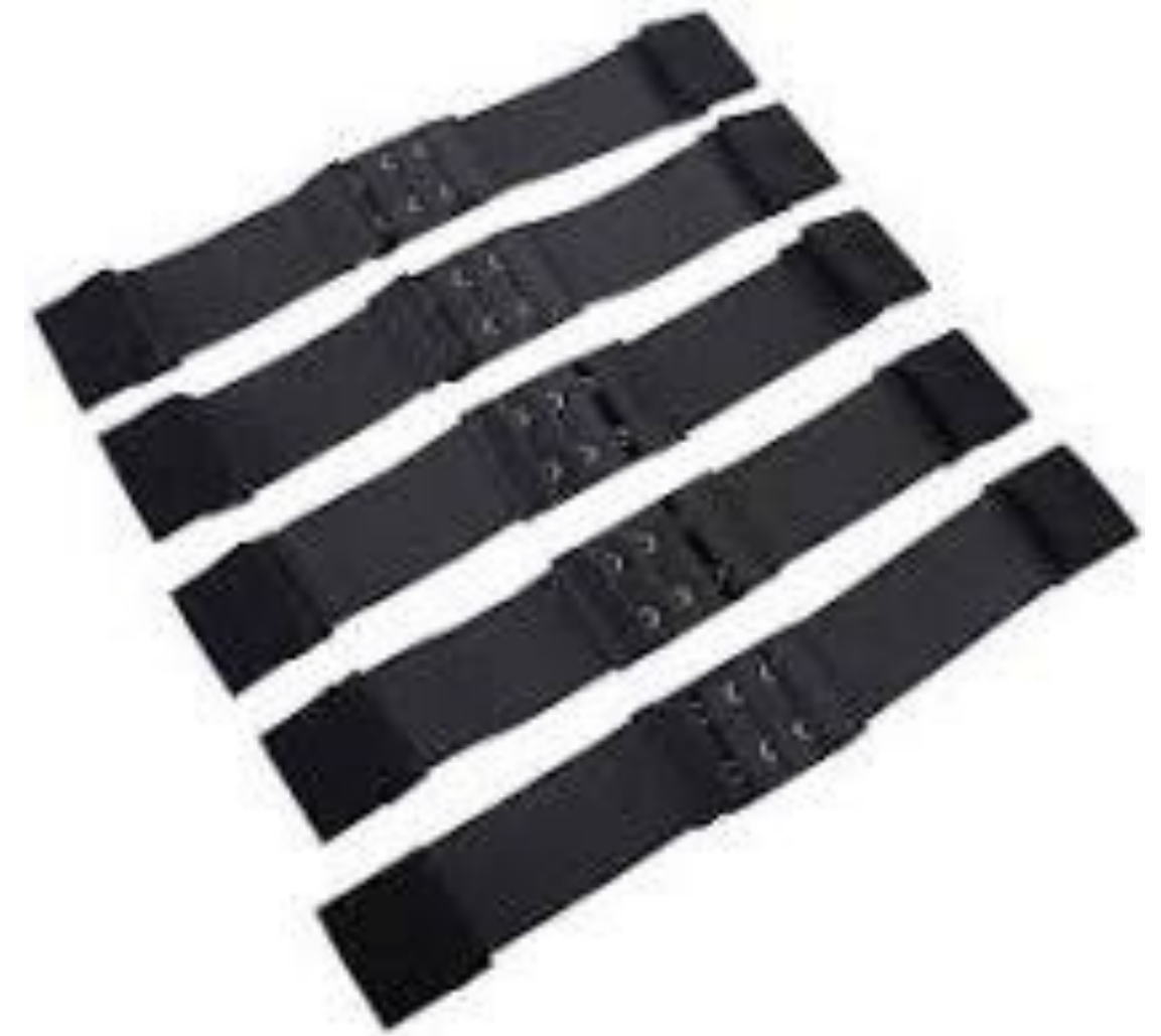
Advanced Alternative: Adjustable Elastic Band Ideal when Client is not present.