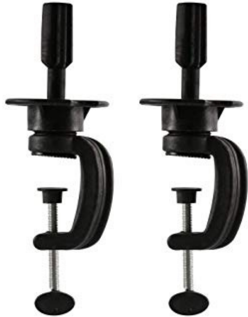
Canvas Block Holder (Cheaper option $7)