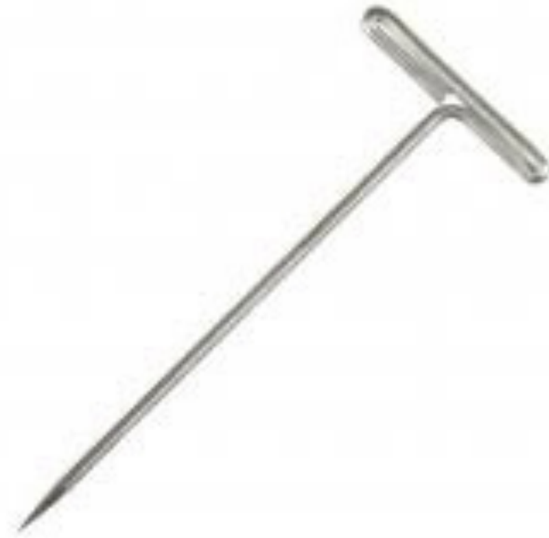
2 inch T-Pins