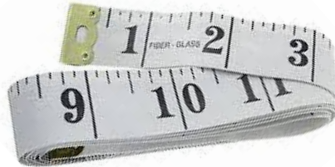
Soft Tape Measure