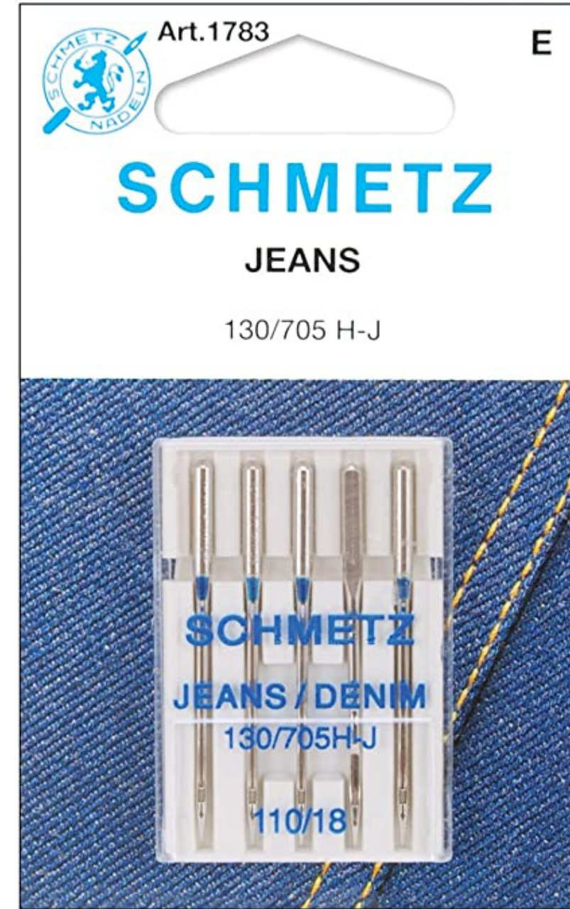
Schmetz Jeans Needle