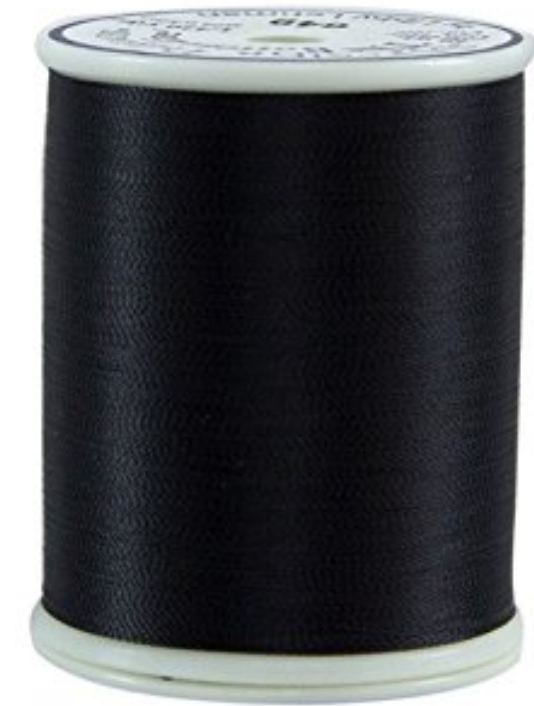
Polyester All Purpose Sewing Thread (You Do Not Need Sew-in Thread in for this class)