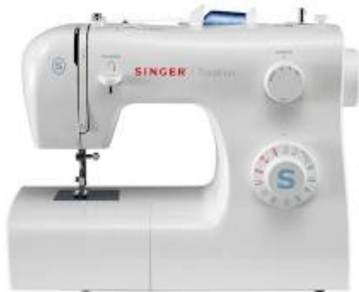
Singer 2251 Tradition Around $150 USD