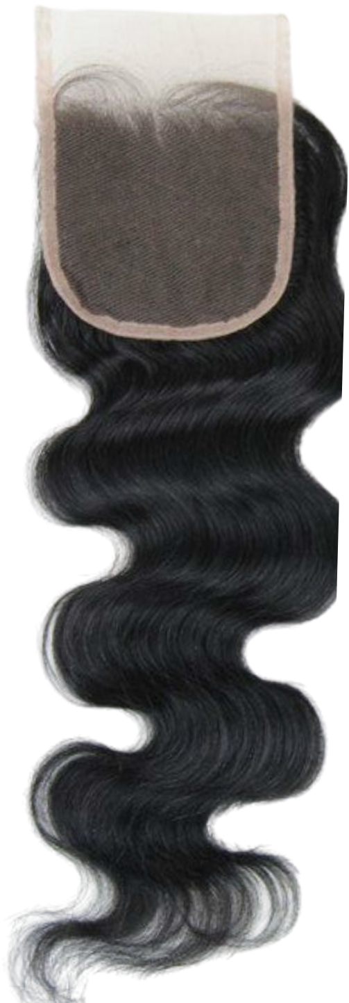
4x4 Lace Closure (12 or 14") + 2 bundles of hair