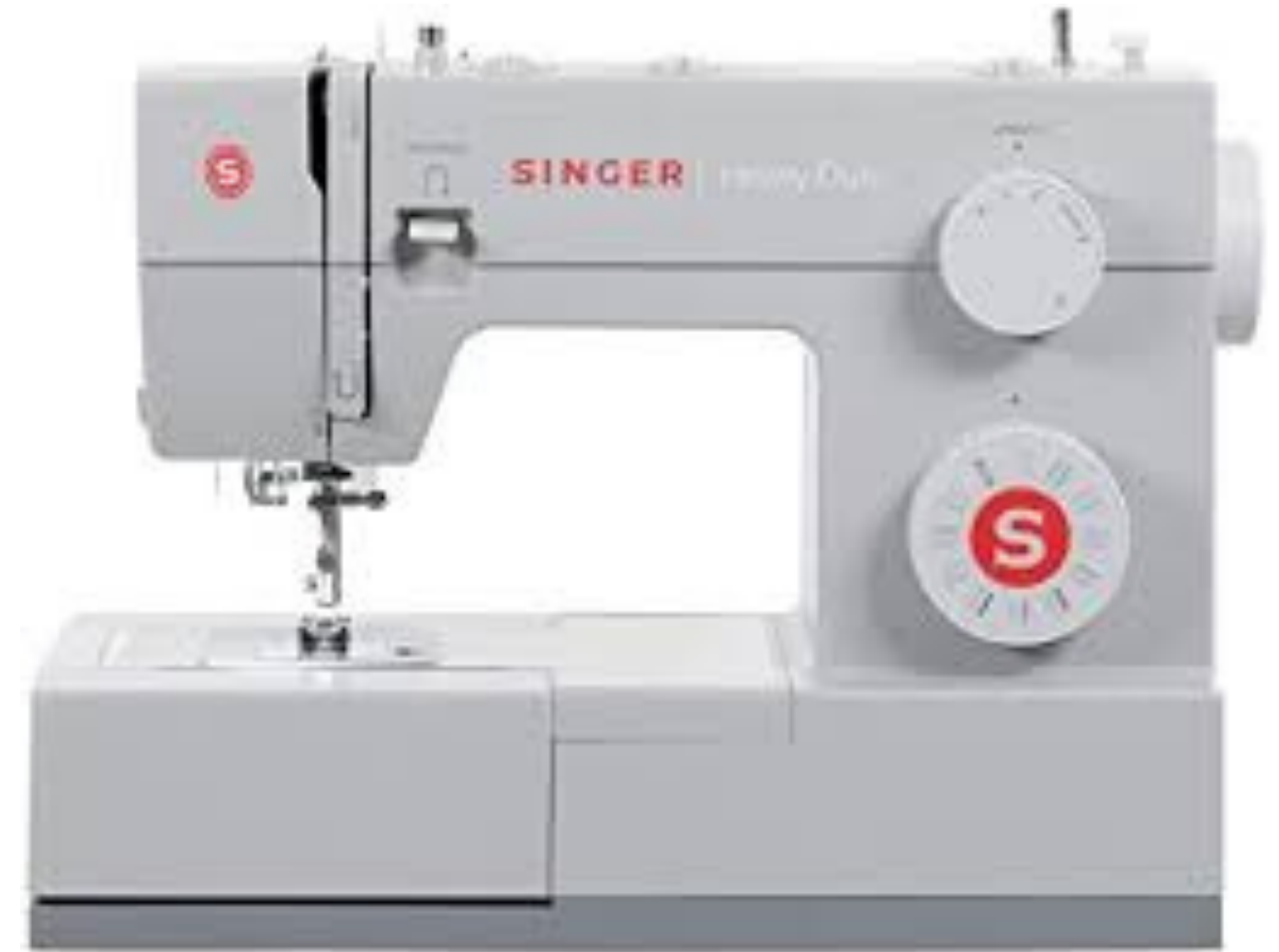
Singer Heavy Duty 4411 Pricier Alternative