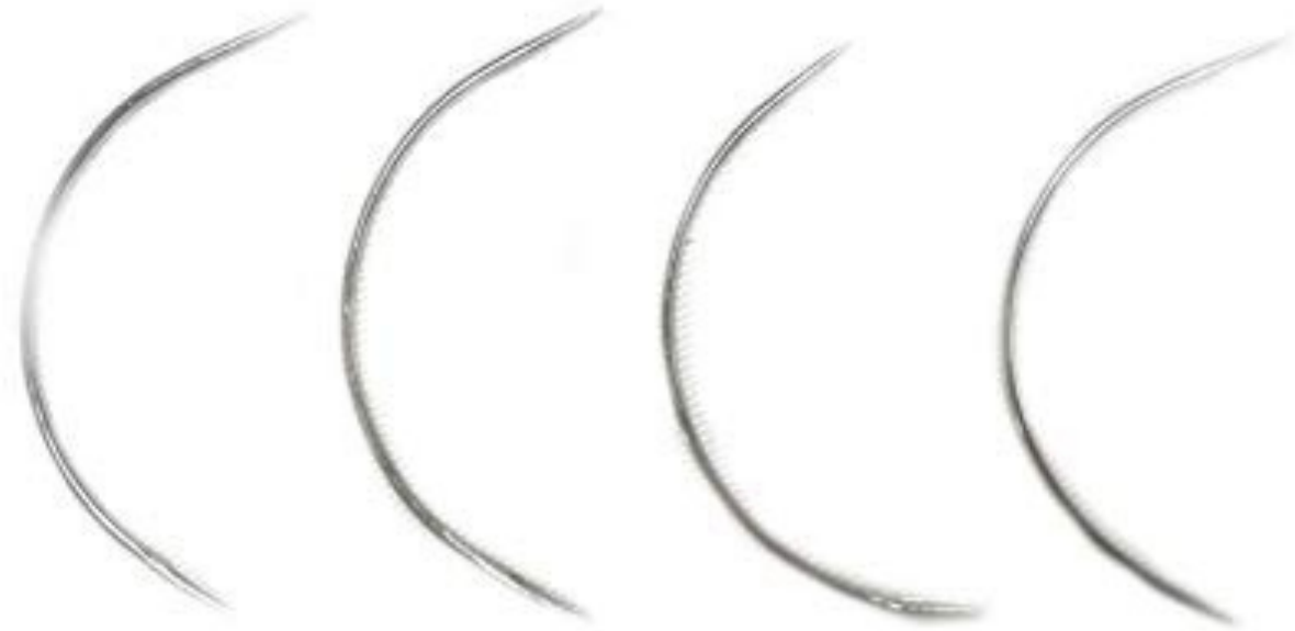
2 x C Needles