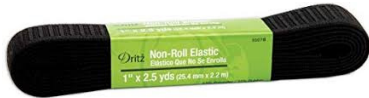
Preferred Elastic: Non-Roll Elastic 1.25 inches