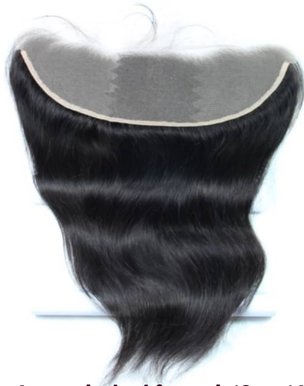
13x4 pre-plucked frontal 12 or 14" + 2 bundles of hair >>

(I PREFER NOT TO BUY BEAUTY SUPPLY FRONTALS)