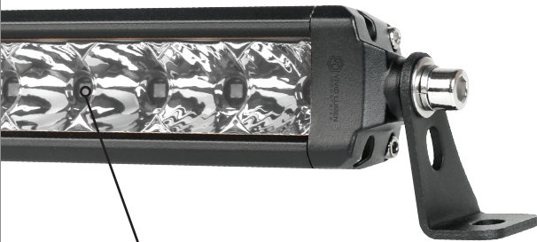
HIGH INTENSITY CHIPS

For tight to fit spots use our rear mounting brackets that are included to Keep your lightbar being sleek.