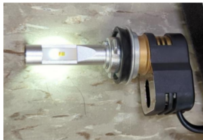
Figure 2 - defect seen clearly