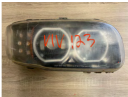
Figure 4 - Acceptable Image