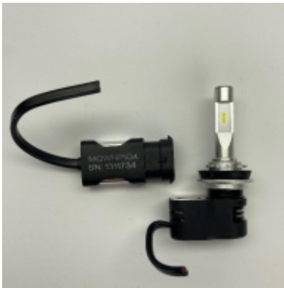
Figure 1 - wires cut and the serial number visible