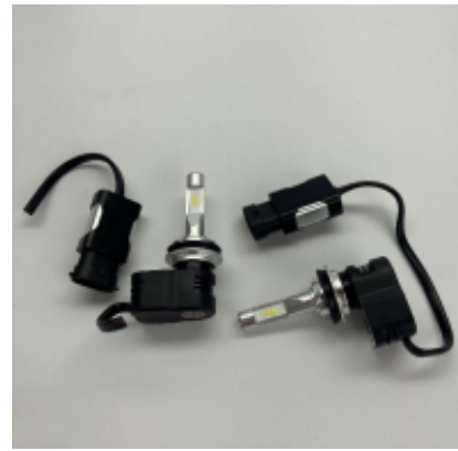
Figure 3 - Unacceptable Image (Multiple products)