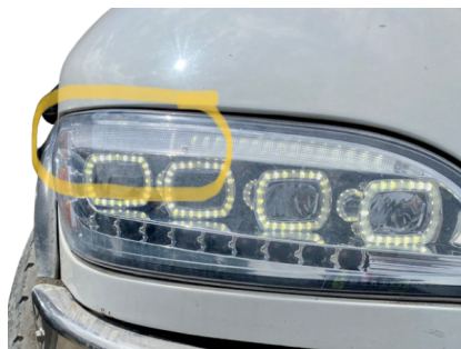
Figure 5 - defect seen clearly