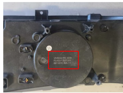
Figure 6 - Serial Number visible