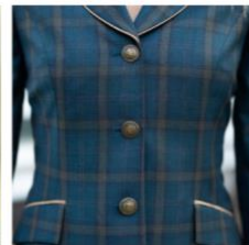
Bronze Metal Button