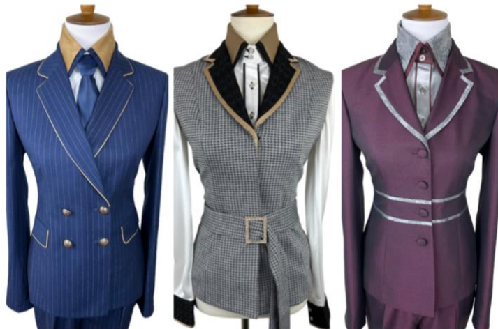
Double Breasted Four Button