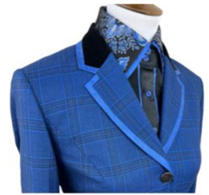
Collar Only Contrasting Fabric