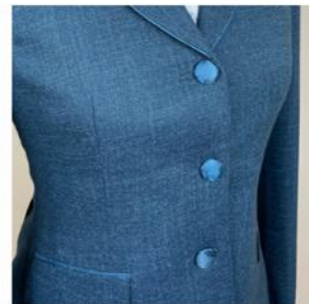
Contrasting Fabric Buttons