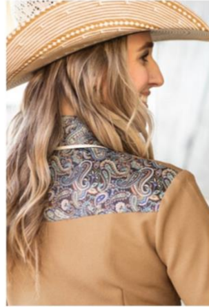
Contrasting Western Back Yoke No Yoke Trim