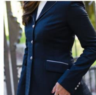
Silver Metal Buttons