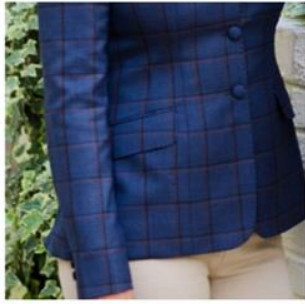
No Pocket Trim