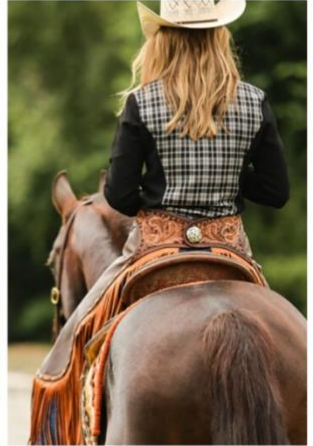
Contrasting Back Panel