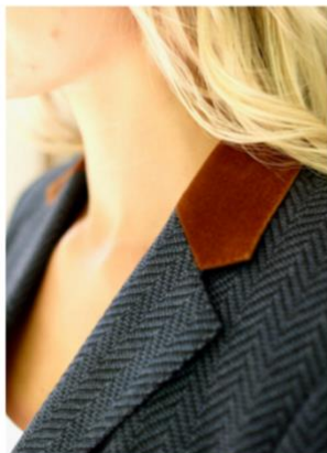
No Trim on Collar or Lapel

We offer hundreds of colors of solid and pattern trims to choose from. Velvet and Suede can also be used as trims.