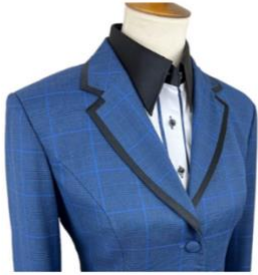
Flat Collar + Lapel Trim