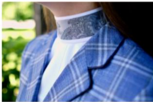
Jacket Fabric Collar