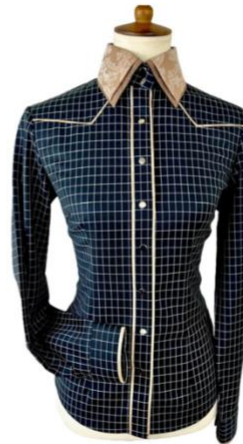
Western Yoke Trim Placket Trim