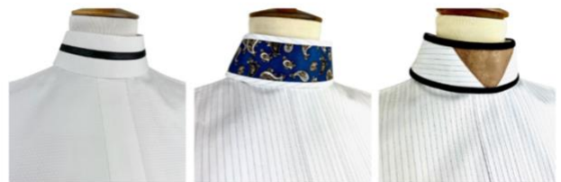
4. Thin Accent Band