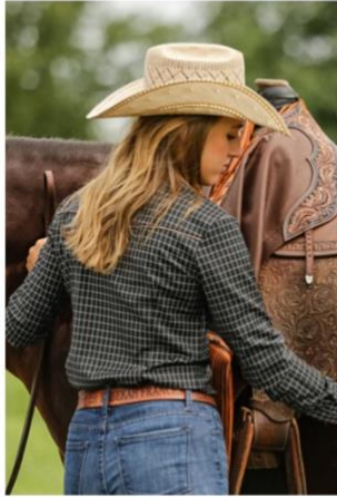
Western Back Yoke Trim