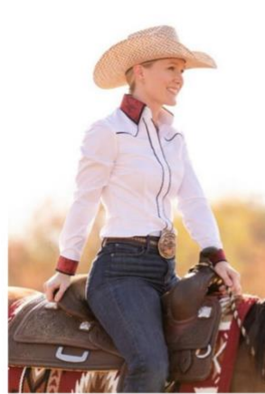
Western Front Yoke Trim Placket Trim