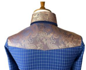
Contrasting Western Back Yoke