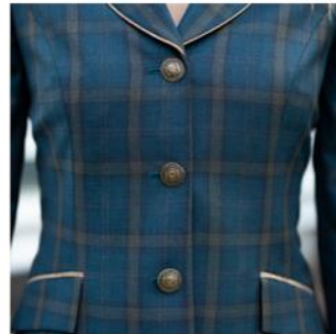
Bronze Metal Button