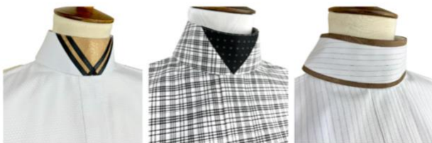
1. Filled in V + Ribbon