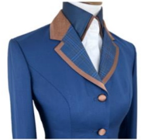
Collar & Lapel Two Contrasting Fabrics