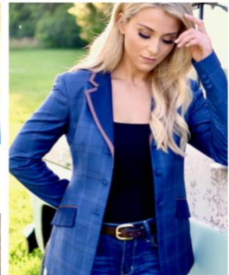
Two Tone Option

Choose a coordinating suiting fabric, velvet, suede or silky fabric. This is used on the jacket collar, lapel and pocket flaps