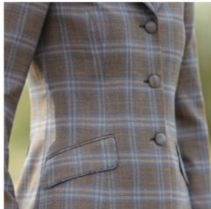
Cloth Covered Buttons