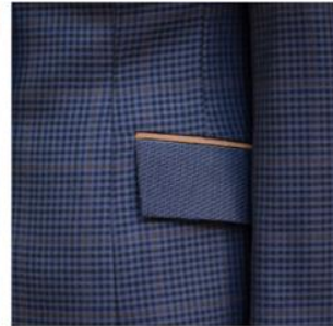
Contrasting Pocket + Pocket Top Trim