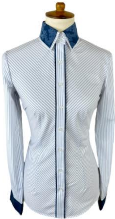
Plain Front Placket Trim