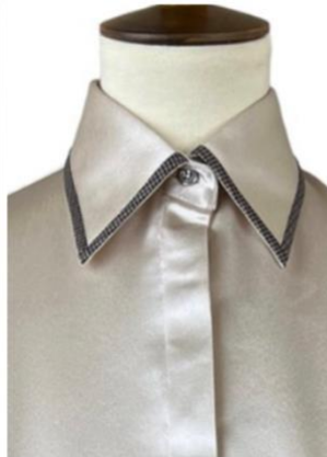
Single Collar Choose Your Collar & Trim Fabrics