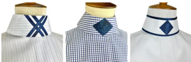
7. Double X