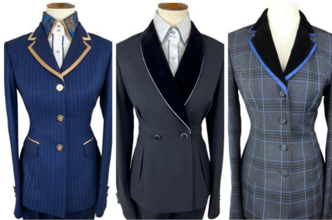
Single Breasted Three Button