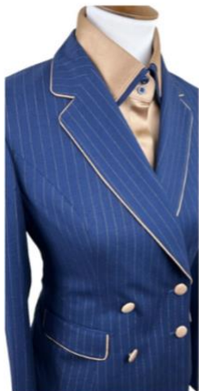
Pocket Edge Trim Rolled