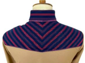
Turned Western Yoke