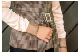
Contrasting Cuff + Trim