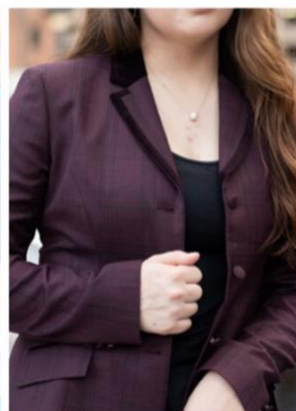
Flat Velvet Trim on Lapel