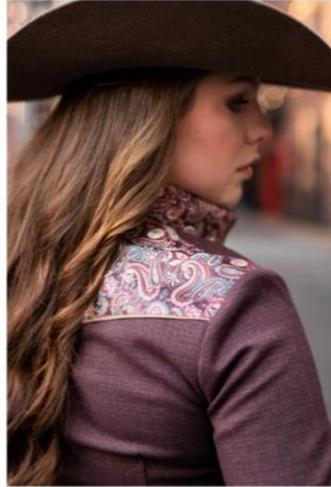
Contrasting Western Back Yoke + Yoke Trim