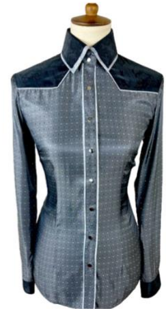
Contrasting Western Yoke + Trim Placket Trim