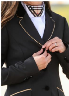
Rolled Trim on Collar & Lapel