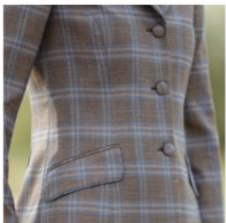
Cloth Covered Buttons