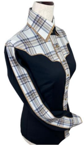
Ornate Western Front Vertical Sleeve Accents