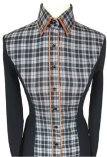
Contrasting Front Panel