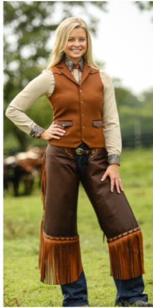
5 Snap Vest Contrasting Pockets Western Yoke Trim