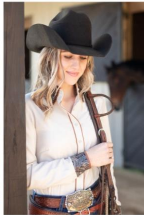
Plain Front Placket Trim