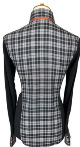
Contrasting Back Panel