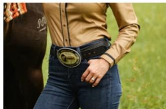
Middle Cuff Trim