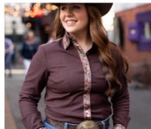
Contrasting Placket + Trim