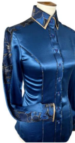
Vertical Shoulder & Sleeve Accents