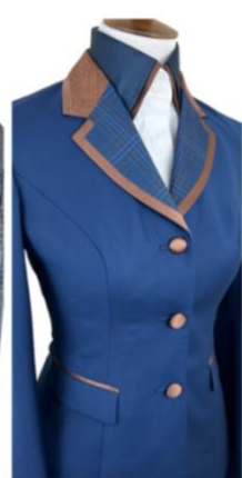
Pocket Flap & Pocket Top Trim