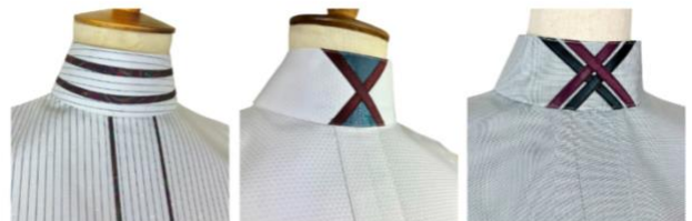
10. Two Thin Middle Bands *Placket Trim Example