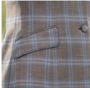
Rolled Edge Trim