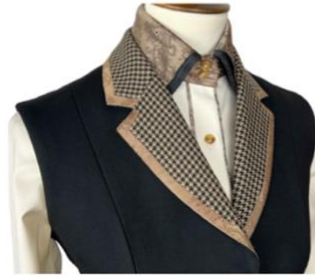
Collar & Lapel Contrasting Fabric