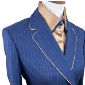
Rolled Collar + Lapel Trim