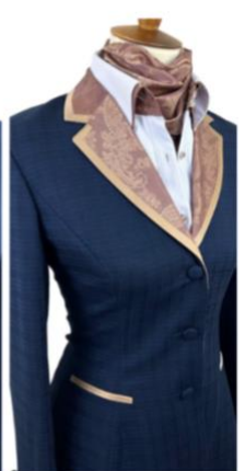
Besom (No Pocket Flap)