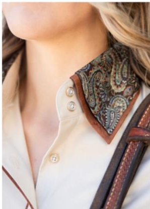
Double Collar Choose Your Top & Bottom Collar Fabrics

We have thousands of options available in Cotton, Cotton Stretch, Satin or our popular Performance Stretch fabrics.