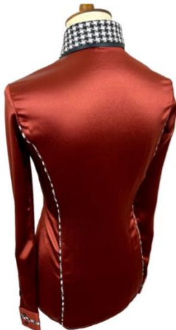
Back Princess Seams