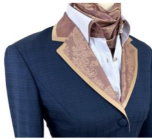
Collar & Lapel Contrasting Silk