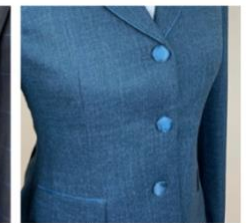
Contrasting Fabric Buttons