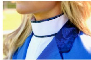
Pattern Silky Collar