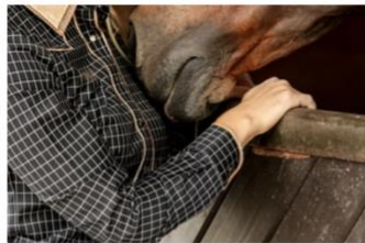
Edge Cuff Trim