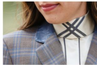
Pattern Silky Collar