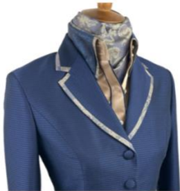
Flat Collar + Lapel Trim