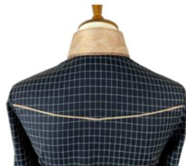
Western Back Yoke Trim