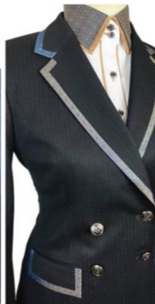
Pocket Edge Trim Flat