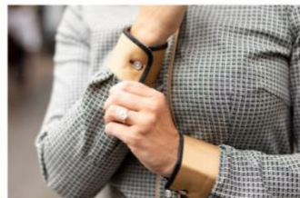
Contrasting Cuff + Trim