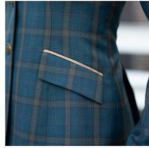
Pocket Top Trim