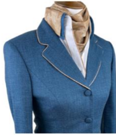
Rolled Collar + Lapel Trim