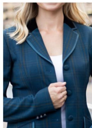
Flat Trim on Collar & Lapel