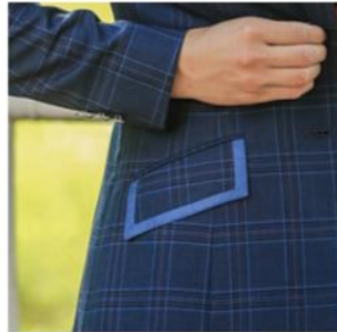
Flat Edge Trim