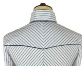
Turned Diagonal Stripes