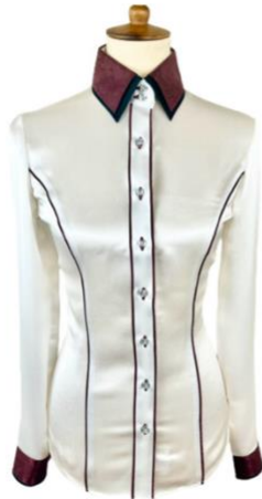
Princess Seams Placket Trim