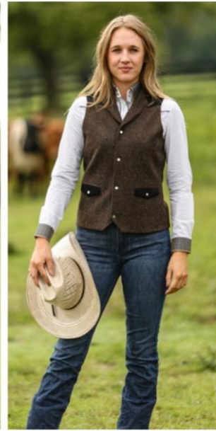
4 Snap Vest Contrasting Pockets Contrasting Western Yoke