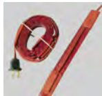
POWER LEAD WITH ARMOR AND PLUG