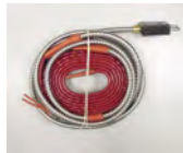
POWER LEAD WITH ARMOR AND PLUG