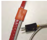
PROCESS SENSOR LOCATED BESIDE THE ELEMENT

Custom configurations include adding Armor, Sensors Thermostats and more. Contact HTS/Amptek® for your ideal application solution.