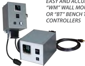
EASY AND ACCURATE "WM" WALL MOUNT OR "BT" BENCH TOP CONTROLLERS