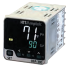
(B3) BBA 300