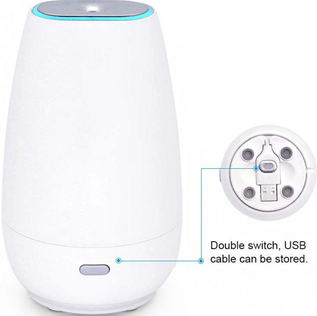
Double switch, USB cable can be stored.