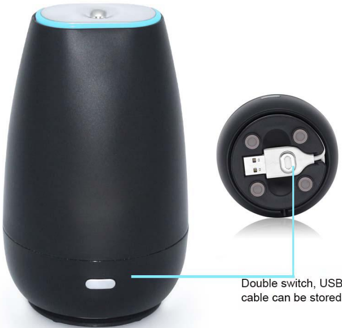
Double switch, USB cable can be stored.