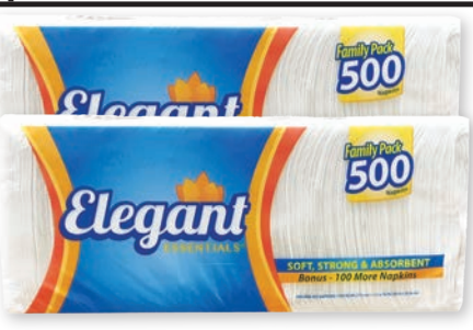
ELEGANT NAPKINS 500 COUNT LIMIT 2