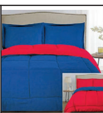
3 PC. REVERSIBLE DOWN ALTERNATIVE COMFORTER SET COMFORTER & 2 PILLOWCASES KING, QUEEN, FULL