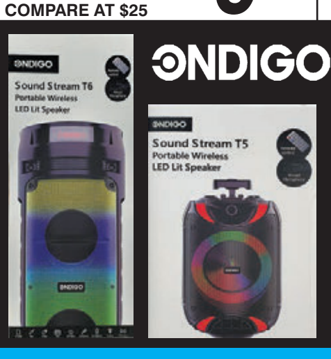
SOUND STREAM PORTABLE WIRELESS SPEAKERS Τ4 T5 Т6