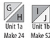
Unit 1a Make 24

2. Stitch Fabrics G and H 3-3/8" triangles together on their long edges. Make a total of 24 Unit 1a (3" square unfinished). In the same manner, make 52 Unit 1b with Fabrics I and J 3-3/8" triangles.