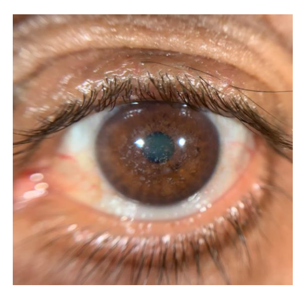
Corneal granular dystrophy type I