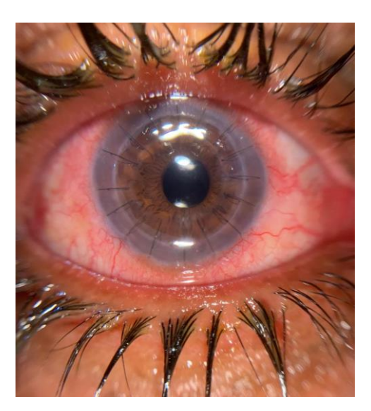
3 weeks post triple case( cataract removal, IOL implantation and keratoplasty)