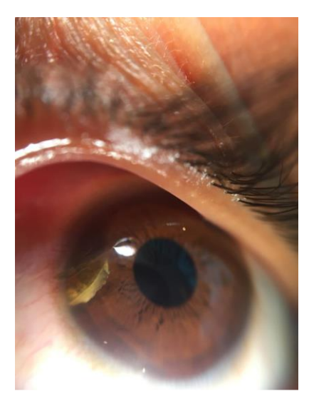
An intraocular foreign body in the AC through a semi self-sealed corneal wound.