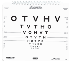
129 - HOTV Chart Set or 120 - LEA SYMBOLS® Chart Set