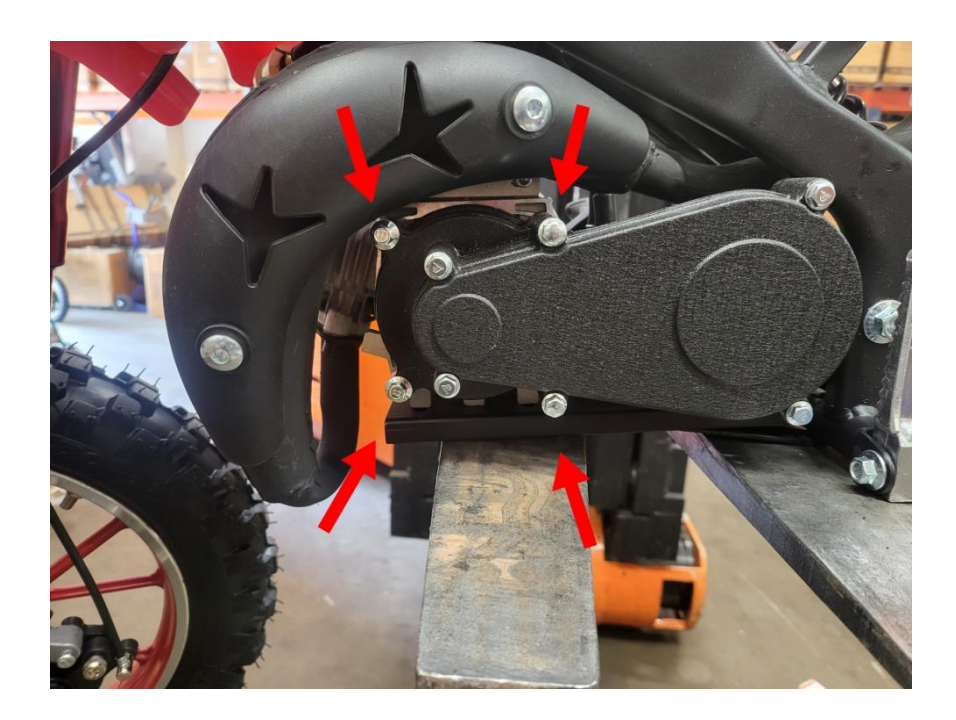
Step 2, Remove the 10mm bolt holding the clutch in place, this is a lot easier with a impact gun than by hand. If you don't have a impact gun this can be done by locking the clutch in place with a flat head screw driver by sliding it through the clutch and wedging it on the engine case. We strongly advise you to use a impact gun of some kind to stop any damage to the cases.