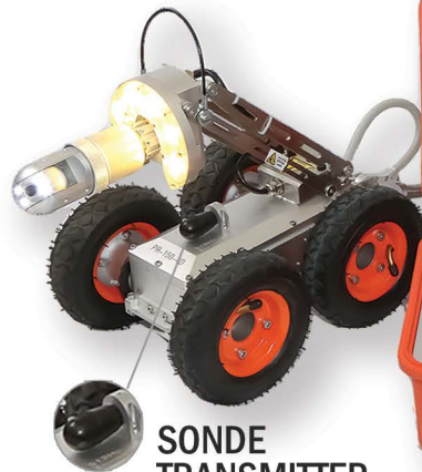
SONDE TRANSMITTER 512 Hz