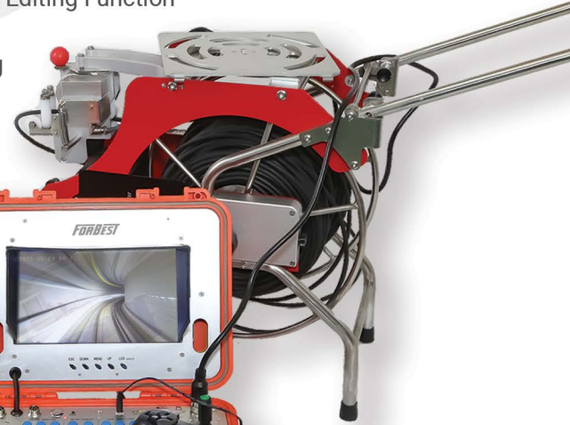
LIGHTWEIGHT CABLE CAR 400ft. (120m) Cable and Footage Counter