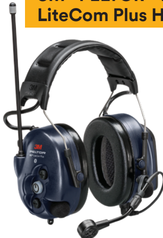
3M™ PELTOR™ WS™ LiteCom Plus Headset