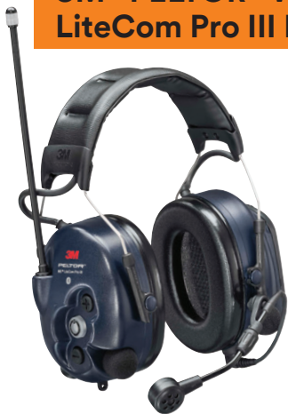
3M™ PELTOR™ WS™ LiteCom Pro III Headset