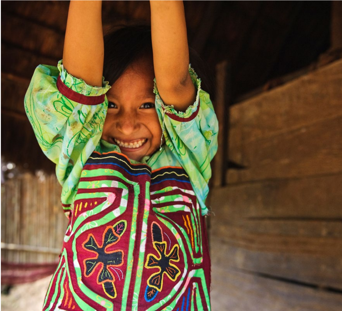
A child plays in Colombia.