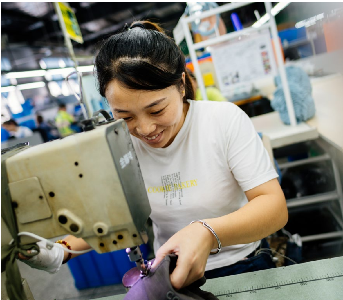
A sewer at our factory partner in China puts the finishing touches on a Cotopaxi baseball cap.

Moving into 2021, our management set additional goals to advance Cotopaxi's internal diversity and inclusion through hiring benchmarking and increased community giving around this issue. We also recognize that climate change is a leading contributor to systemic poverty. As such, Cotopaxi has committed to carbon neutrality and will continue to build on its sustainable design principles and offsetting programs.