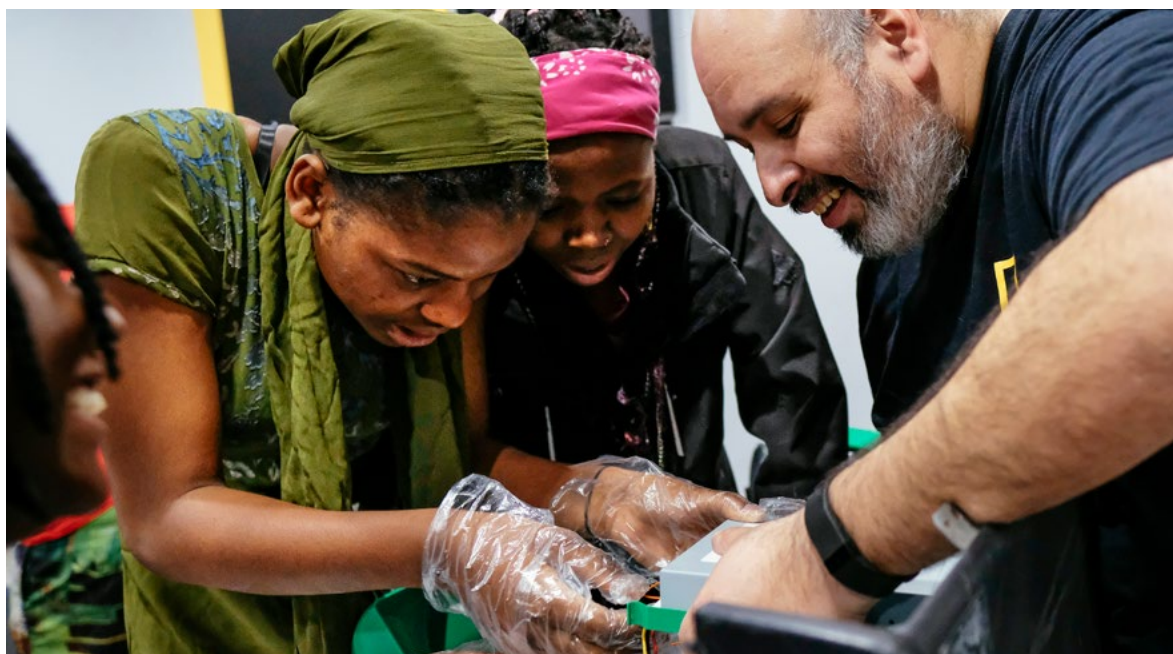
Refugees participate in a computer building workshop held by the International Rescue Committee in SLC.