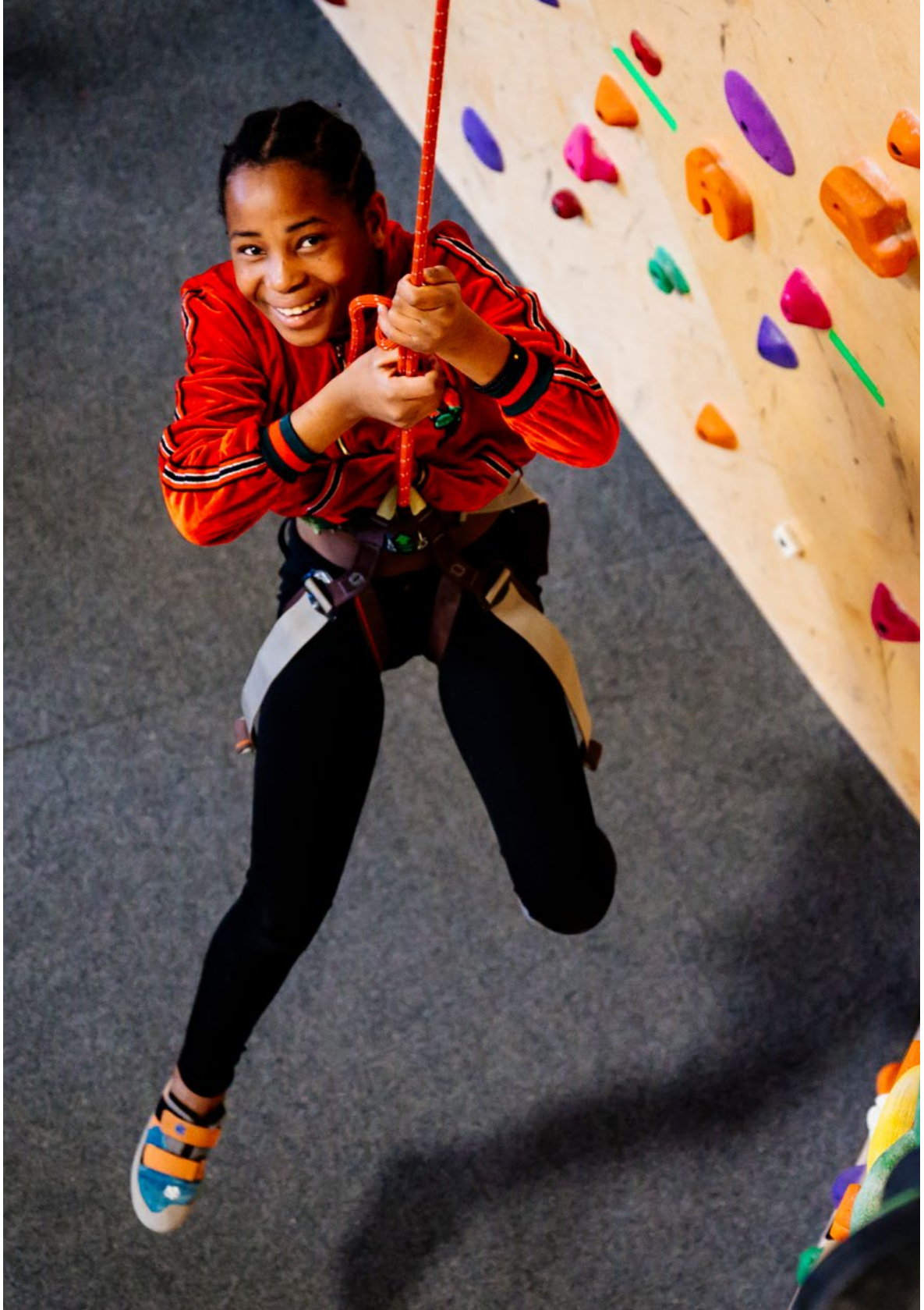
A young refugee participates in an IRC- and Cotopaxi-sponsored rock-climbing educational event.