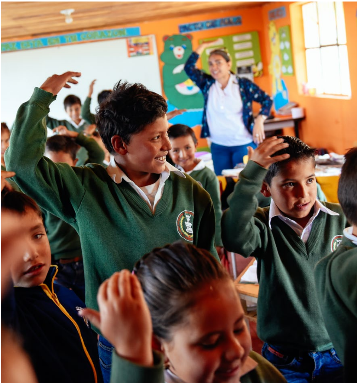
Colombian children attend a school that employs the FEN education model.

In 2021, we have a goal of assisting 1 million people in poverty through programs and community activation and of providing 150,000 people with product donations. To close gaps in human development and economic equity, Cotopaxi must set sufficiently ambitious goals. We will also be further expanding our programs into education and girls' and women's empowerment as gender gaps were widened last year.