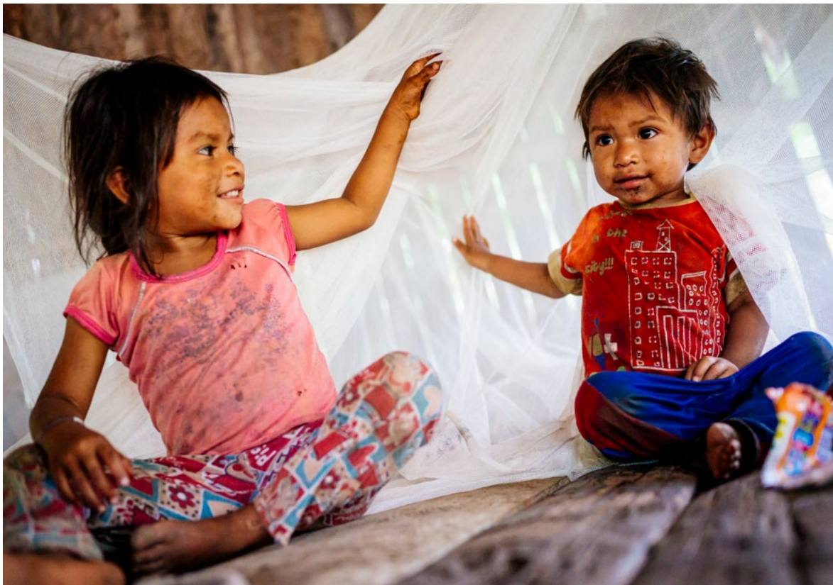
Children in Ecuador play near a mosquito net distributed by Nothing But Nets.