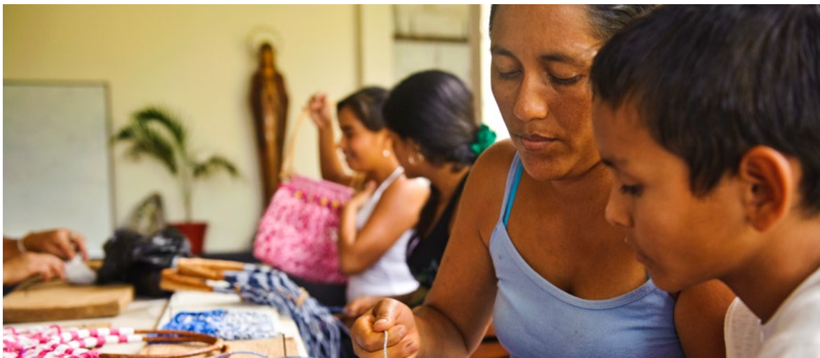
Mercy Corps works with families in Colombia in response to the Venezuelan refugee crisis.