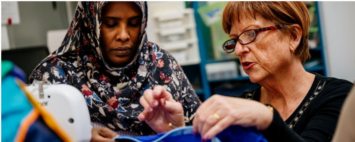
FROM TOP: A worker at our down supplier in China analyzes samples; a sewer at our factory partner in China shares a joke between projects; a refugee woman in Salt Lake City participates in our repairs program.