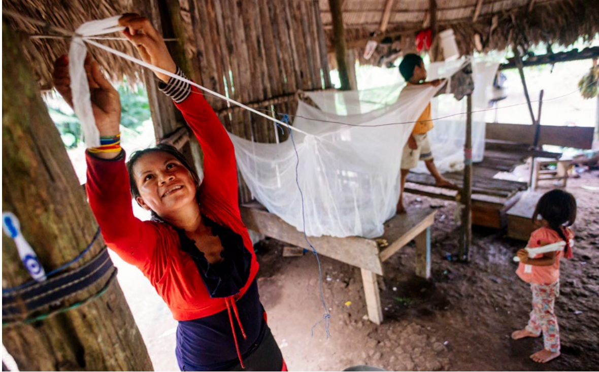
A mother in Ecuador hangs a mosquito net distributed by Nothing But Nets.