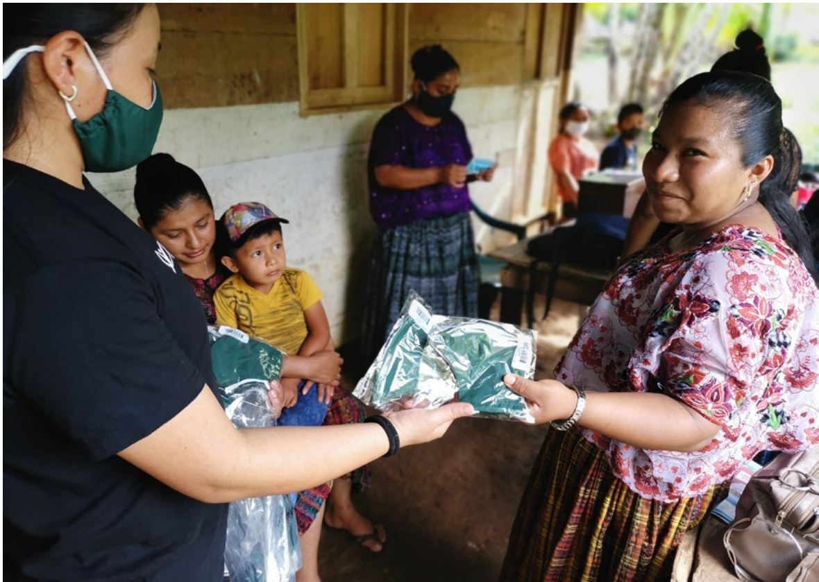
Mercy Corps distributes face masks to at-risk communities in Colombia.