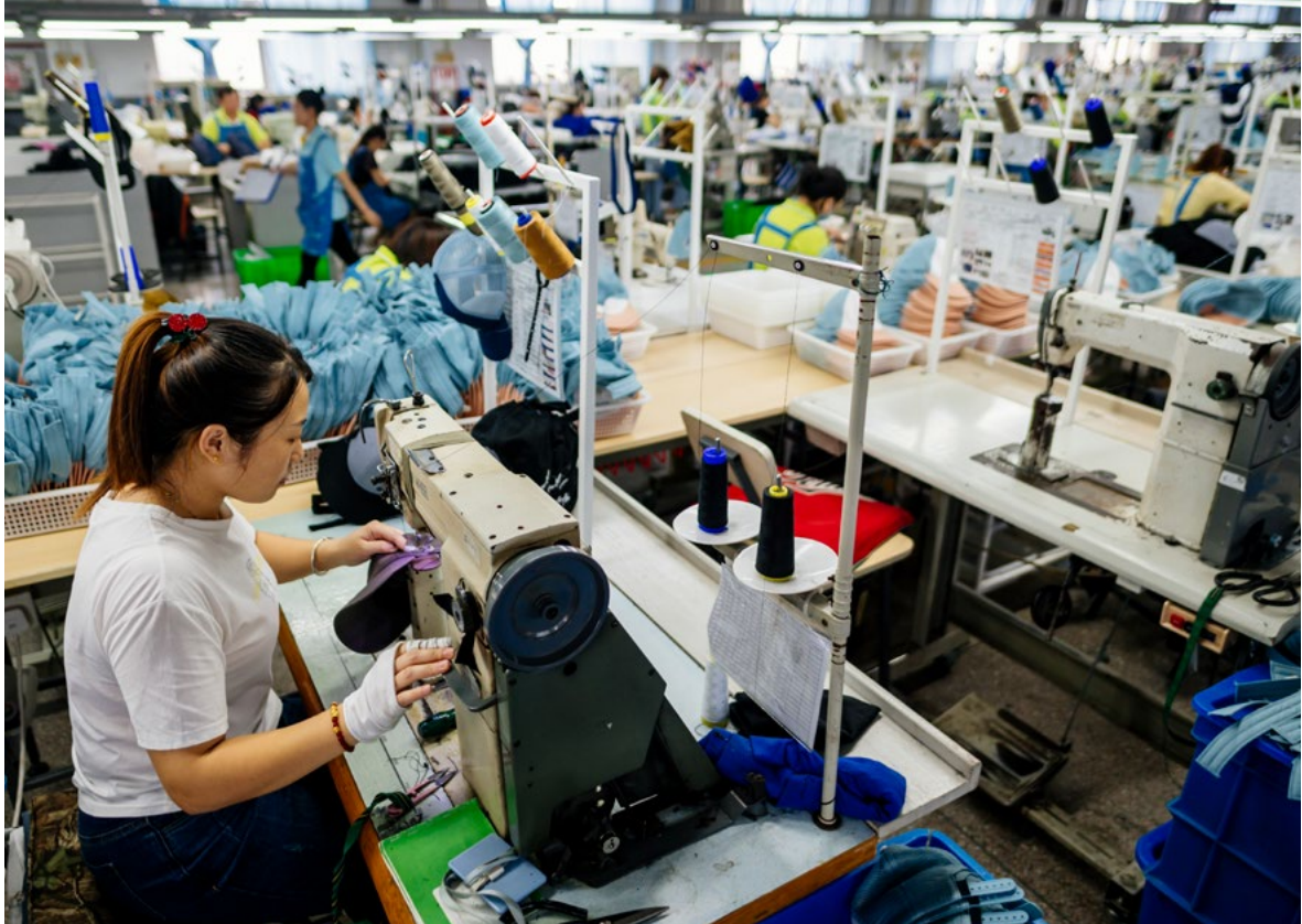
A sewer at our factory partner in China works on a Cotopaxi baseball cap.