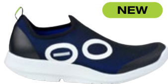
Black/Black JUNE 2023