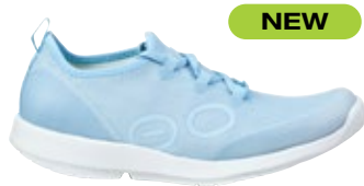
White/White JUNE 2023