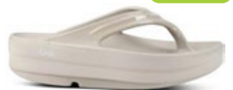
NEW Nomad TBC 2023