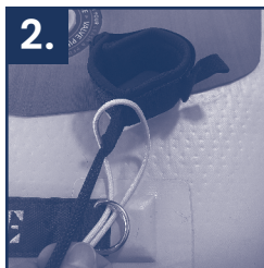
2. Feed leash cuff through nylon loop.