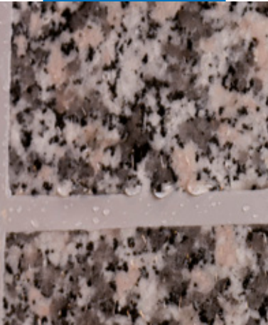
Sealing a butt joint on natural stone

Finish the surface of Mapesil LM with a suitable damp tool or a tool dipped preferably in soapy water before the skin forms on the surface.