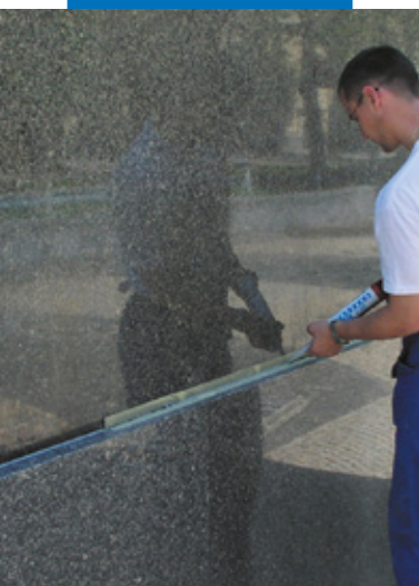
Sealing a façade joint with Mapesil LM

All relevant references for the product are available upon request and from www.mapei.com