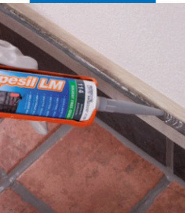
Sealing a fillet joint on natural stone