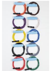
PRO-E4 or PRO-E5 (2 purple, 2 black); PRO-E3 (red, yellow, black); PRO-E12SAF (10 color set)