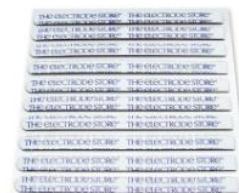
Disposable Hydrogel Ring Electrodes 100mm x 8 mm; 1mm thick (RE-D) $42 per pack of 100