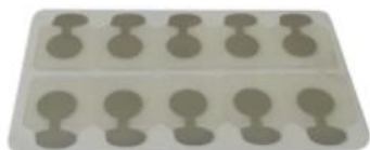
NuTab-100 Hydrogel Electrodes Economical 12mm dia. Ag/AgCl tabs $11 per pack of 100