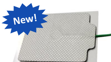
Extra Large Ground Electrode 50mm x 40mm, 1m green wire (1029) Introductory Price: $42/pack of 20