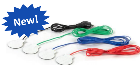
Set of 4 Round Hydrogel Electrodes 20mm dia., red, green, black, blue (1m) $68 for 10 sets of 4 (1026)