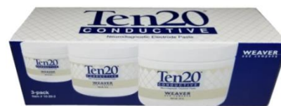
Ten20 Conductive Adhesive Paste 3-pack of 8 oz jars; by Weaver & Co. $47 for 3 large (8 oz) jars