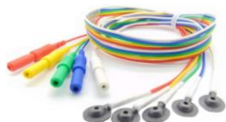
Disposable EEG Cup Series 1m or 2m wire (5 colors) Starting at $29 per pack of 25