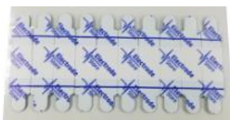
Hydrogel Bar or Tab Electrodes 12mm x 10mm tabs, 3cm apart (PT30) $42 per pack of 100 (200 if split)