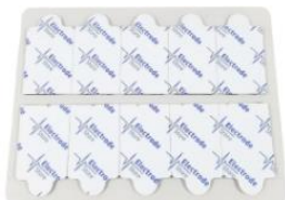
Large Hydrogel Ground Electrodes 38mm x 25mm; 1 mm thick, (FT-3) $42 per pack of 100

Reduce infection risk with these time-saving, high-quality-signal alternatives!