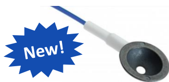
Disposable EEG "Deep Cup" Series Holds more paste; 1.5m x 10 colors Introductory Price: $10/set of 10